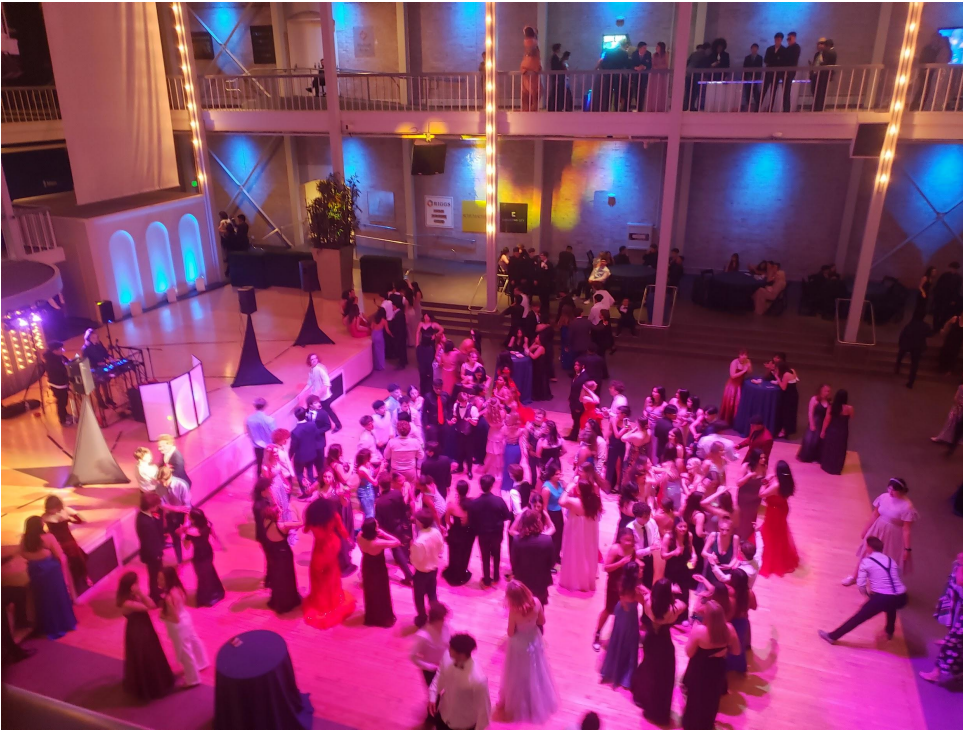
Students on the dance floor