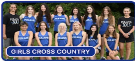
GIRLS CROSS COUNTRY