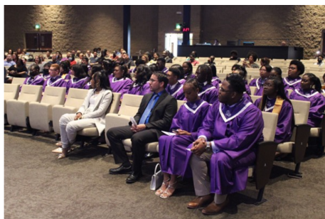
Photo from 2022 Baccalaureate ceremony

Graduation Baccalaureate Service - Sunday, May 21, 2023 3pm-4pm. Living Hope Church. Doors open at 2:30pm for line up and photo opportunities. Baccalaureate is a All-denominational ceremony that offers a quieter, more intimate celebration for our graduating seniors with their families. No tickets or registration required, just show up with your gown (no cap).