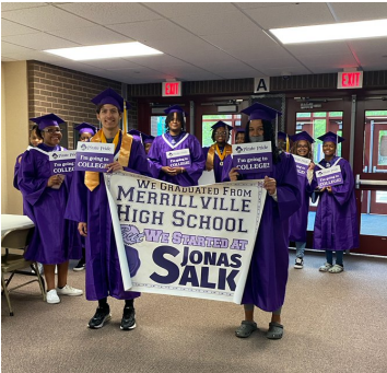
Photo from last years walk around

Senior Walk around- This Friday for seniors who signed up and turned in permission slips. . Don't forget to bring your cap and gown.