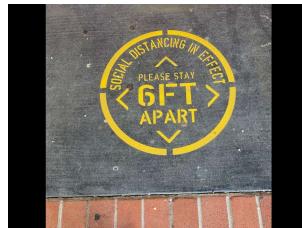
View the site changes.