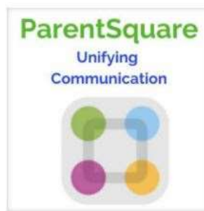
View the parent videos.

As we announced back in December, we are very excited to be adopting ParentSquare as a new form of communication for College Park and in the MDUSD. Parent Square is designed to keep parents informed and facilitate participation at school. It provides a safe way for the school principal, teachers, staff, and parents to: