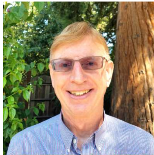
Join Zoom meeting.