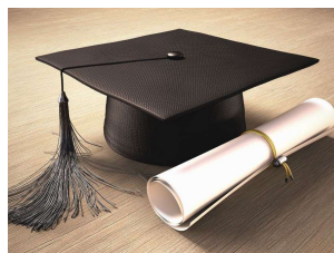
Download the order form.

Jostens or call (925) 838-1835 to place your order.