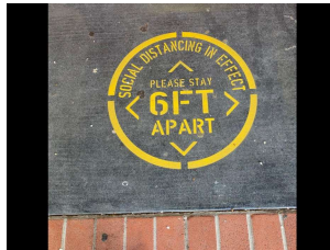
View the site changes.