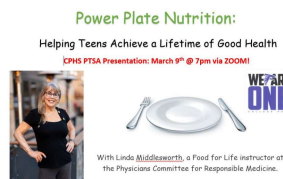
Download the flyer.