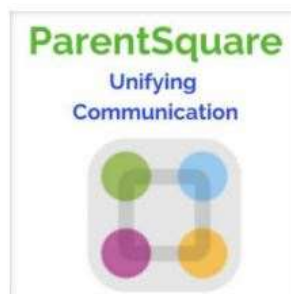
View the parent videos.

As we announced back in December, we are very excited to be adopting ParentSquare as a new form of communication for College Park and in the MDUSD. Parent Square is designed to keep parents informed and facilitate participation at school. It