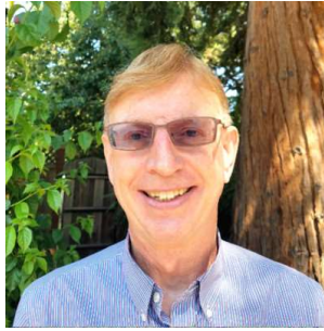
Join Zoom meeting.