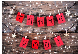
View the teacher wish lists.