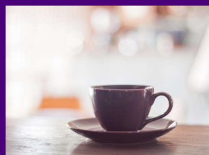
September 17, 8:45 AM Download 8/27 presentation.