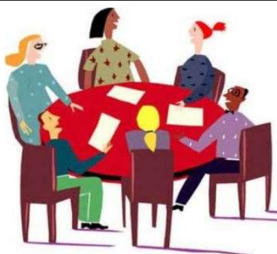
Complete the nomination form.