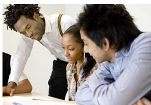
Visit the Peer Tutoring page.

Peer Tutoring began Tuesday, September 7, 2021. It will be for at least an hour after school in the library every Tuesday and Thursday.