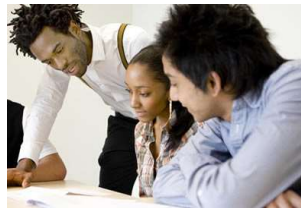
View the RTI FAQs.

RTI time is built into the schedule and takes place every Wednesday and Thursday starting August 18. This week students will stay with their current teachers following the below schedule: