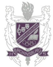
Brownsburg High School Crest

This logo should only be used by BCSCPD.