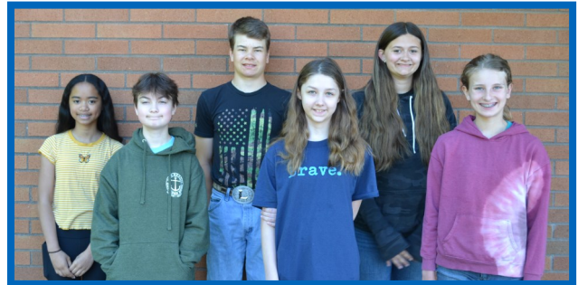
May Students of the Month

All Students are eligible to receive a free yearbook. Students accounts need to be at a $0 balance to receive a yearbook. Student bills were mailed with Quarter 3 report cards. Please check with the office if you have any questions.