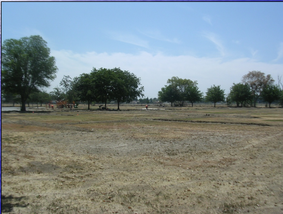
Mineral King - Before