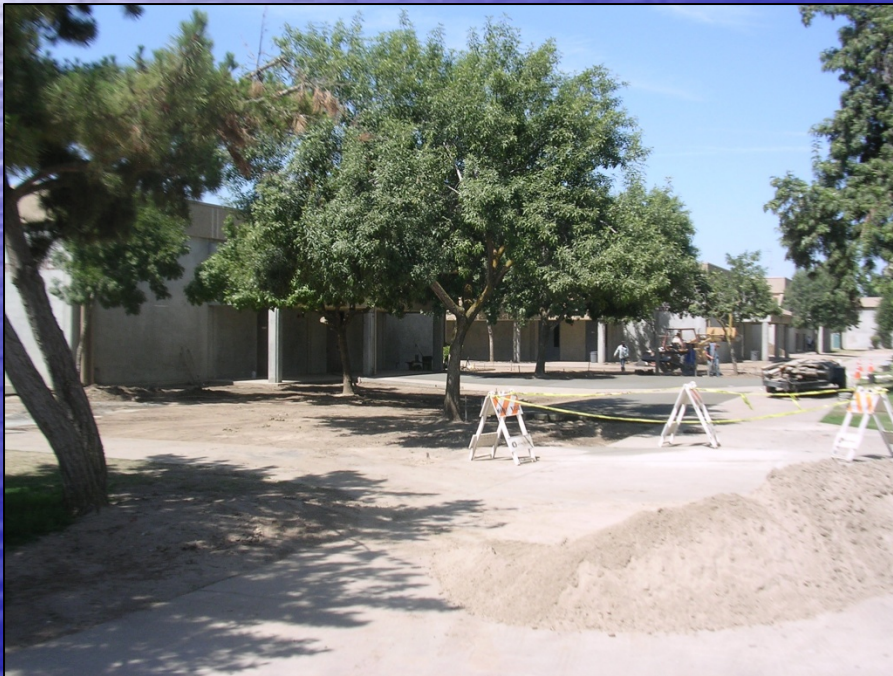
Golden West - Before