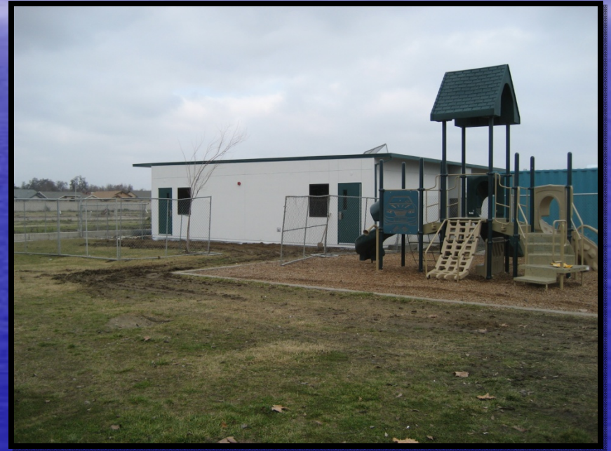
Four Creeks Elementary