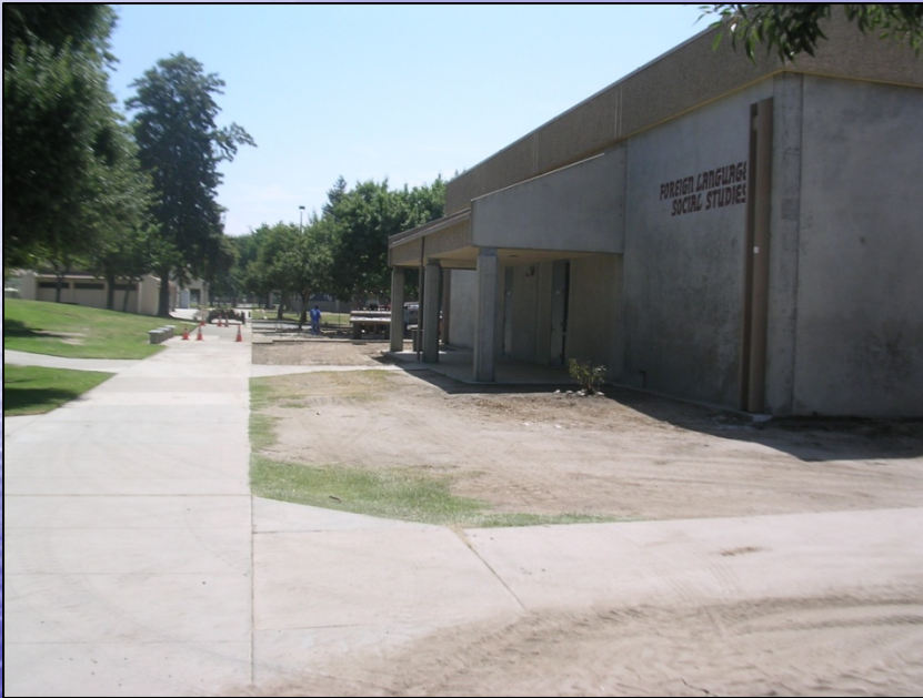
Golden West - Before