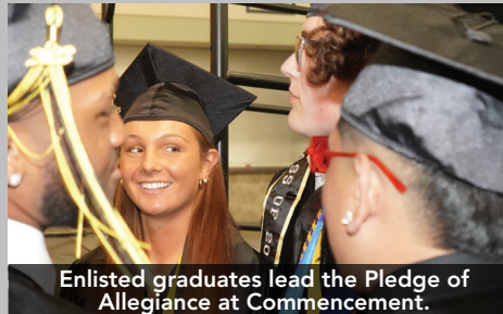
Enlisted graduates lead the Pledge of Allegiance at Commencement.