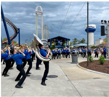
Lakewood High School Band performing at Cedar Point.