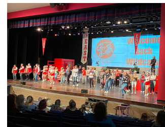
LHS Production of High School Musical