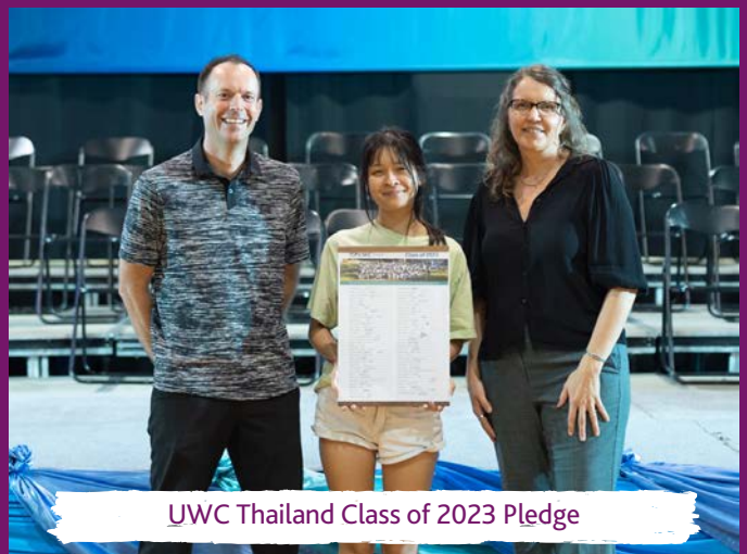
UWC Thailand Class of 2023 Pledge

The UWC Pledge is a powerful commitment made by students and alumni of the UWC movement. It embodies values of sustainability, cross-cultural understanding, and peace, inspiring individuals to make a positive impact on our global community. The pledge can be fulfilled through various ways, by giving their time, treasure or talent. Read more about UWC Pledge here .