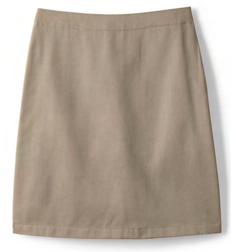
Girls Solid A-Line Skirt Navy/Khaki