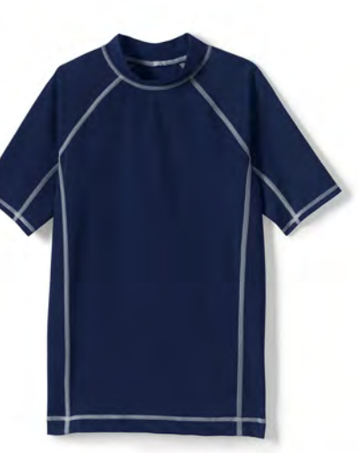
Boys & Girls SS Rash Guard Navy