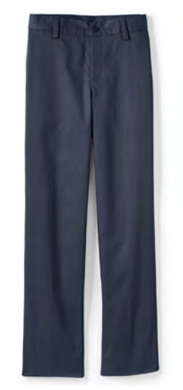
Boys Iron Knee Blend Plain Front Chino Navy