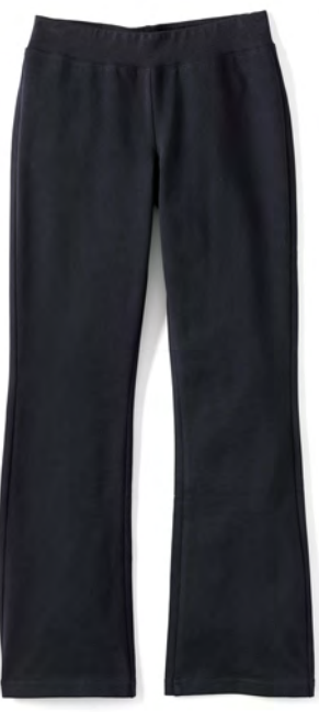
Girls Yoga Pant

Girls House Shirt (Red/Yellow/Blue/Green)