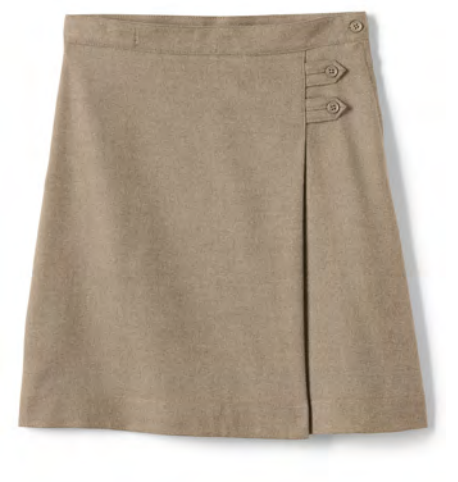
Girls Front Stretch Chino Skort Navy/Khaki