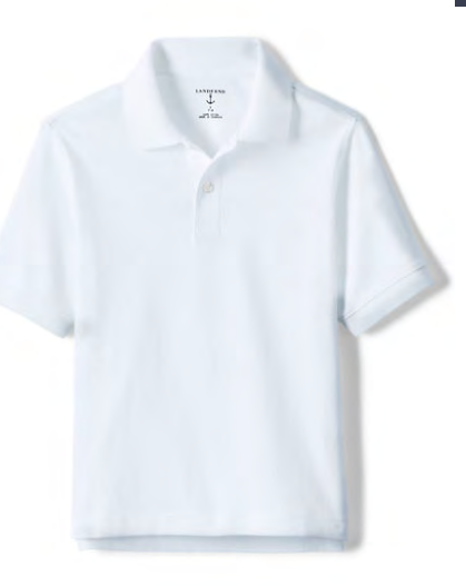
Short Sleeve Interlock Polo