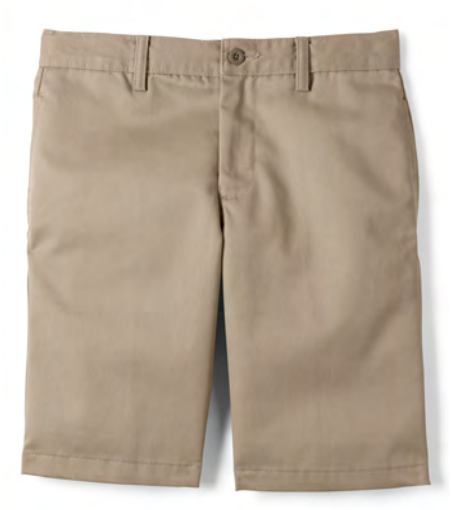
Plain Front Blend Chino Shorts Khaki