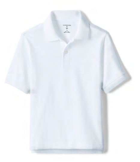
Short Sleeve Rapid Dry Polo