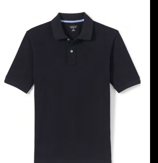
Black Polo with Gold Logo