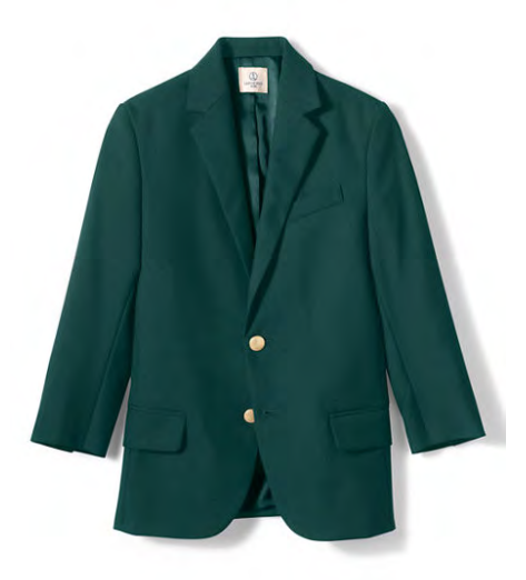
Boys Hopsack Blazer Evergreen