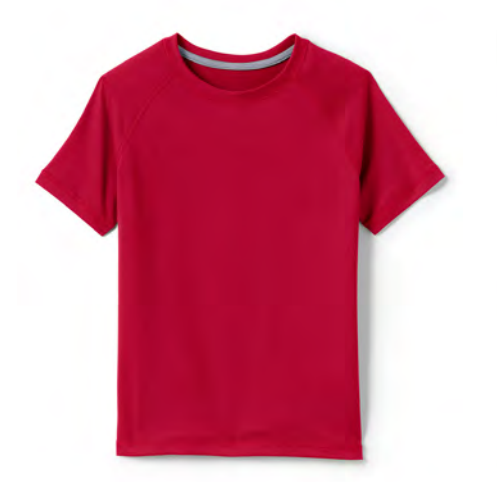
Boys House Shirt (Red/Yellow/Blue/Green)