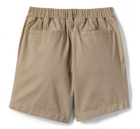
Girls Elastic Waist Shorts Navy/Khaki