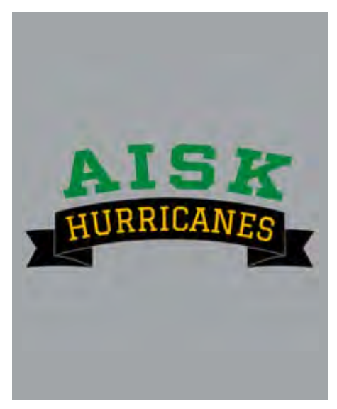
PE Tee Logo