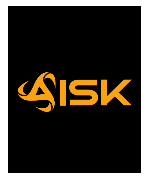
PE Shorts Logo