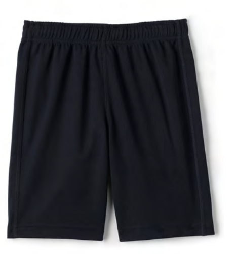
Boys Mesh Shorts