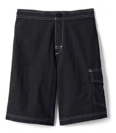
Boys Solid Swim Board Shorts