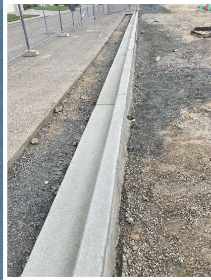
Curb & Gutter in Progress