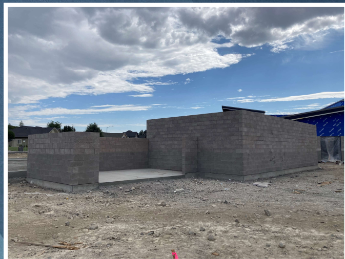
Chiller & Trash Enclosure