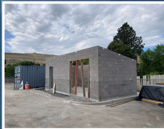
Pump House Erected