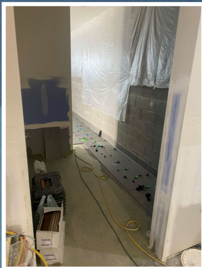
Tile Install Started