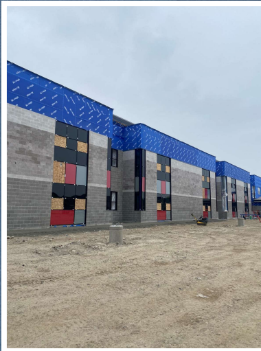
Northside Exterior Progress