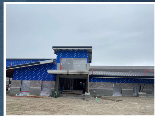
Main Entrance Progress