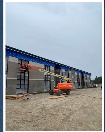
Southside Exterior Progress