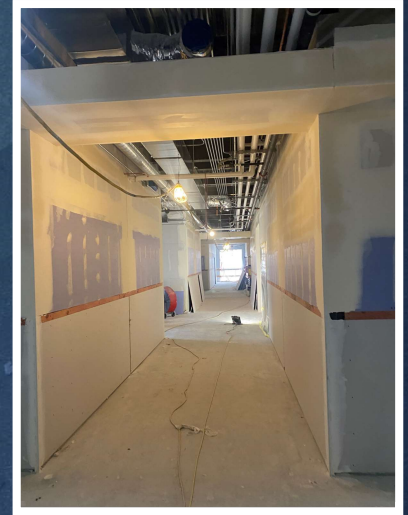
Level 2 Tape & Mud