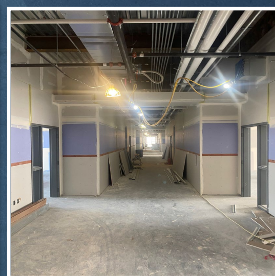
L2 Hallway Progress