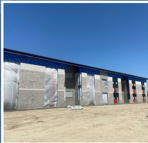
Southside Exterior Progress