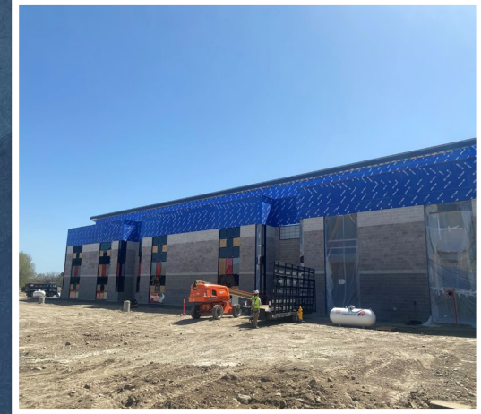
Northside Exterior Progress