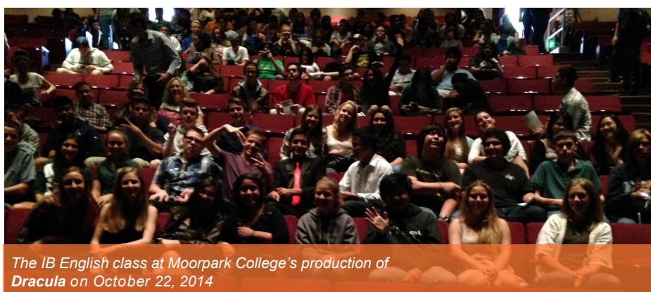
The IB English class at Moorpark College's production of Dracula on October 22, 2014