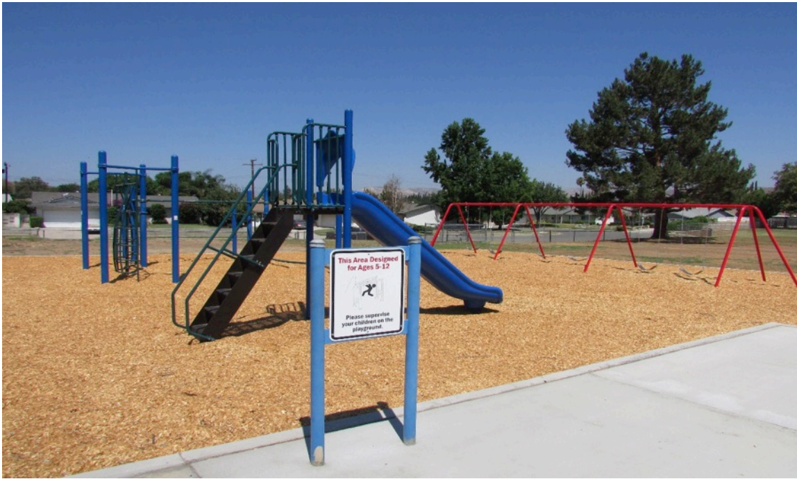
Katherine Elementary Play Equipment