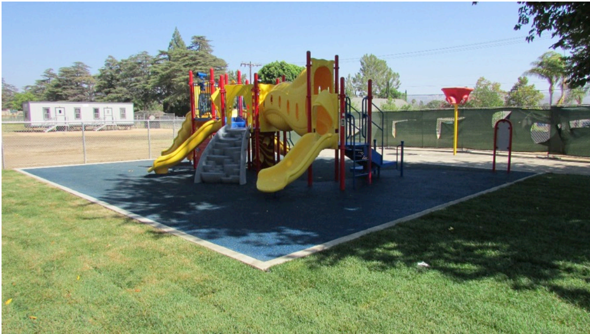
Township Elementary Kindergarten Play Equipment