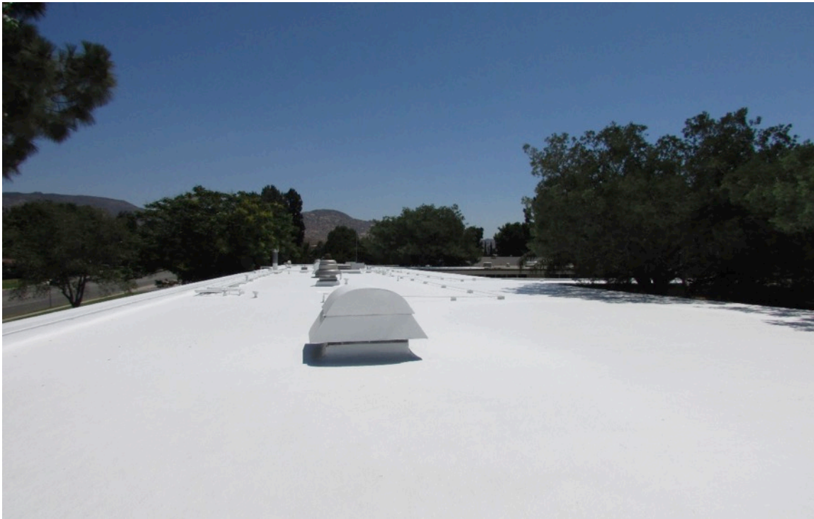
Simi Valley High School Building #6 Re-roof