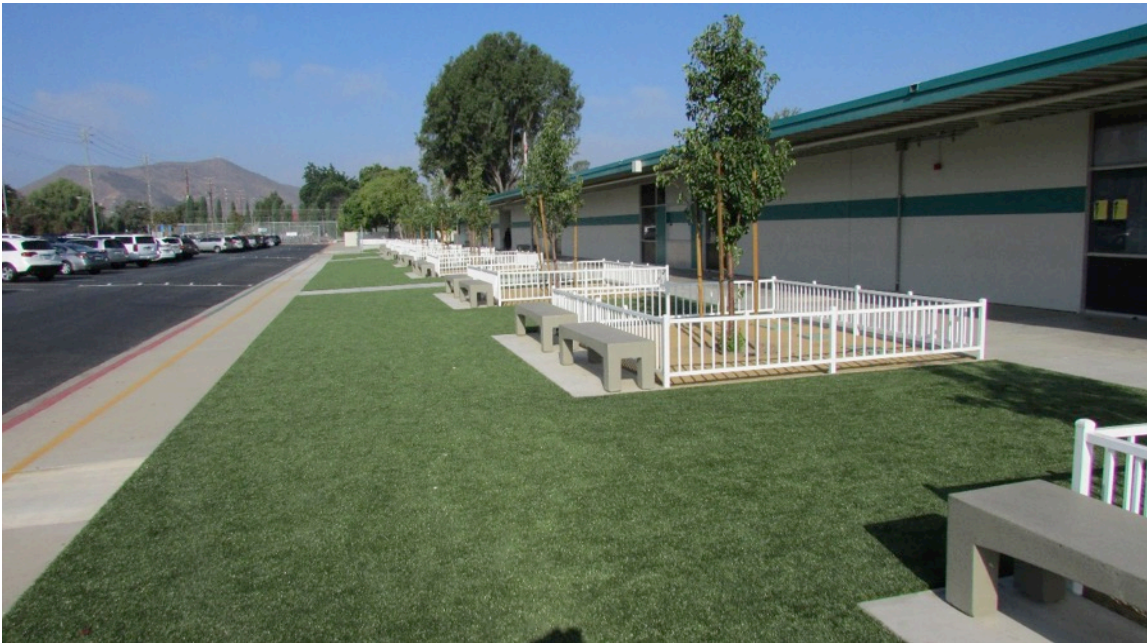
Sinaloa Middle School Beautification