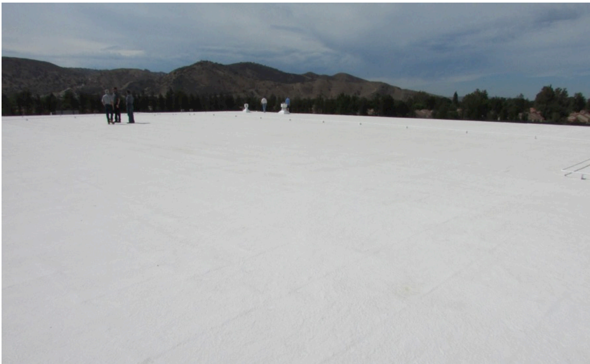
Simi Valley High School Gym Re-roof