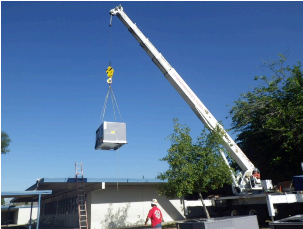
Township Elementary School