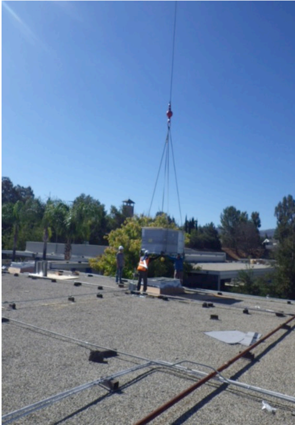
Madera Elementary School