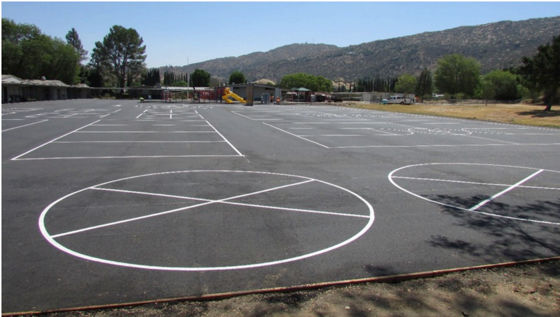
Knolls Elementary Playground – New Pavement