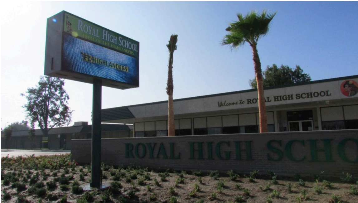
Royal High School Beautification