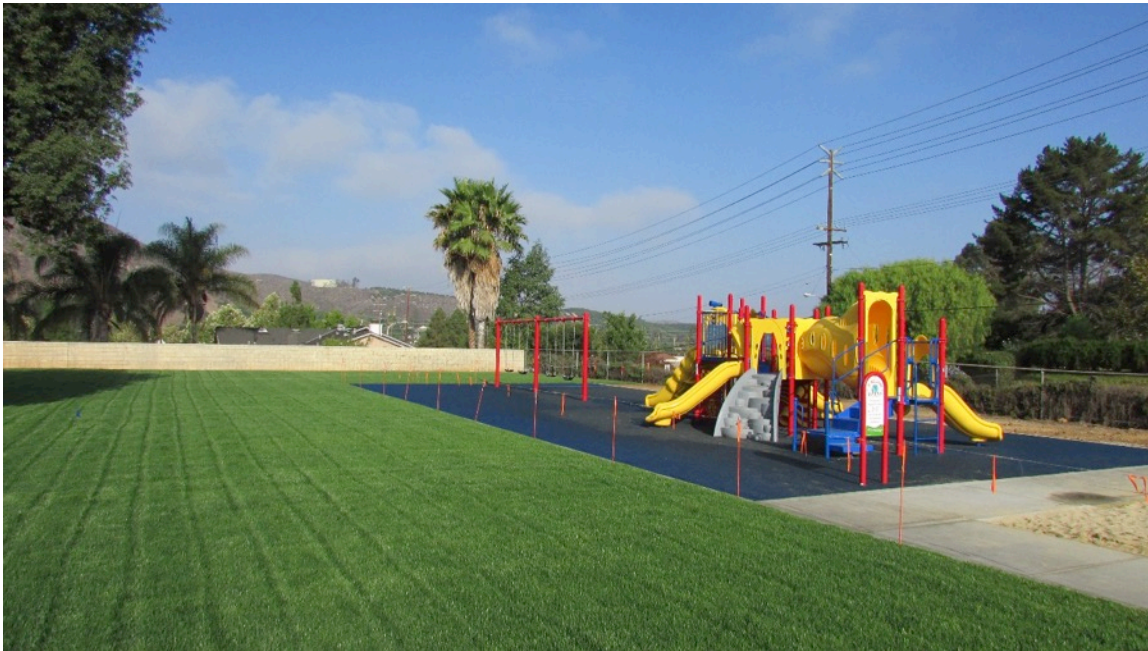
Madera Elementary Kindergarten Play Equipment