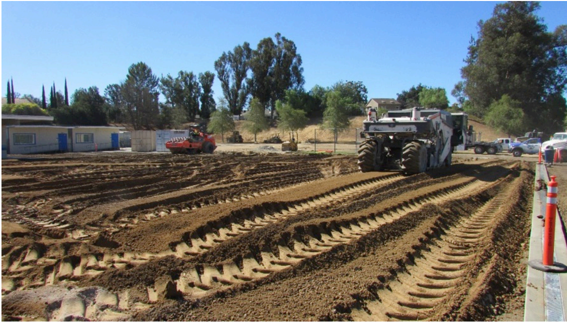
Madera Elementary Playground Preparation for New Pavement