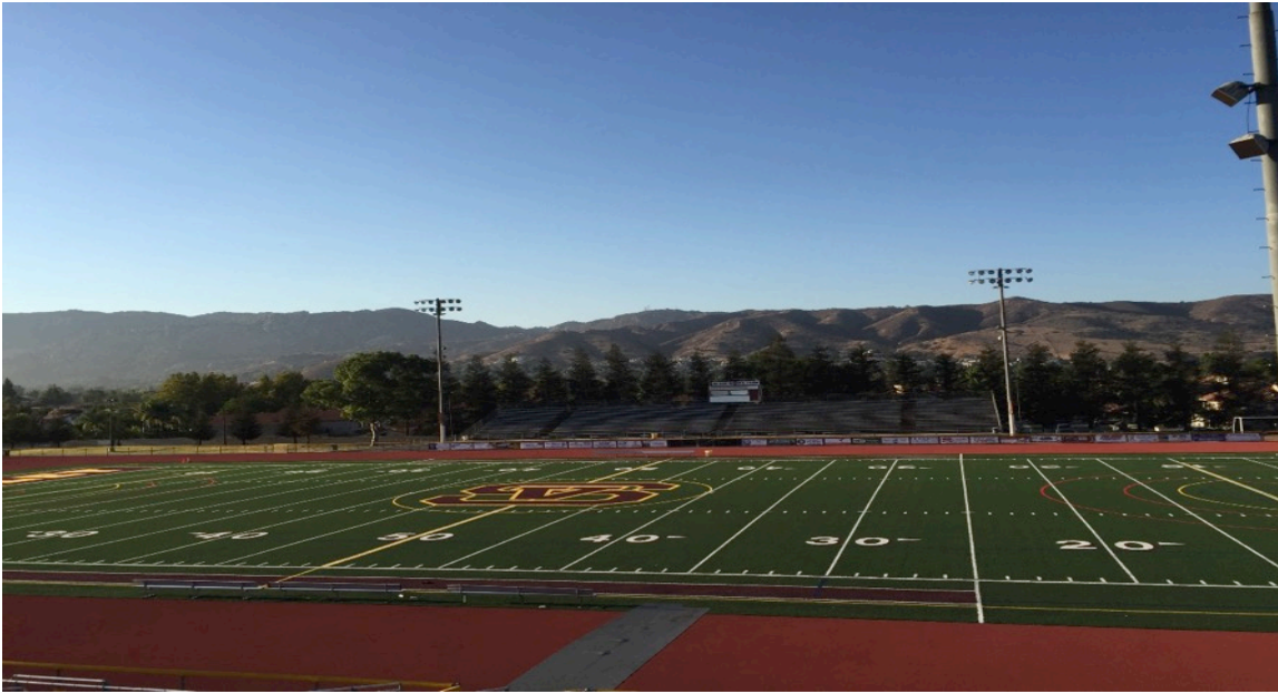
Simi High School Track and Field