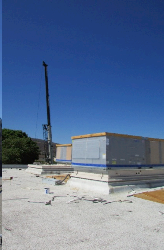
Mountain View Elementary School