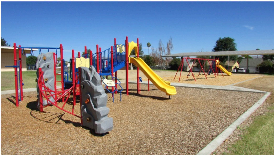
Crestview Elementary Play Equipment