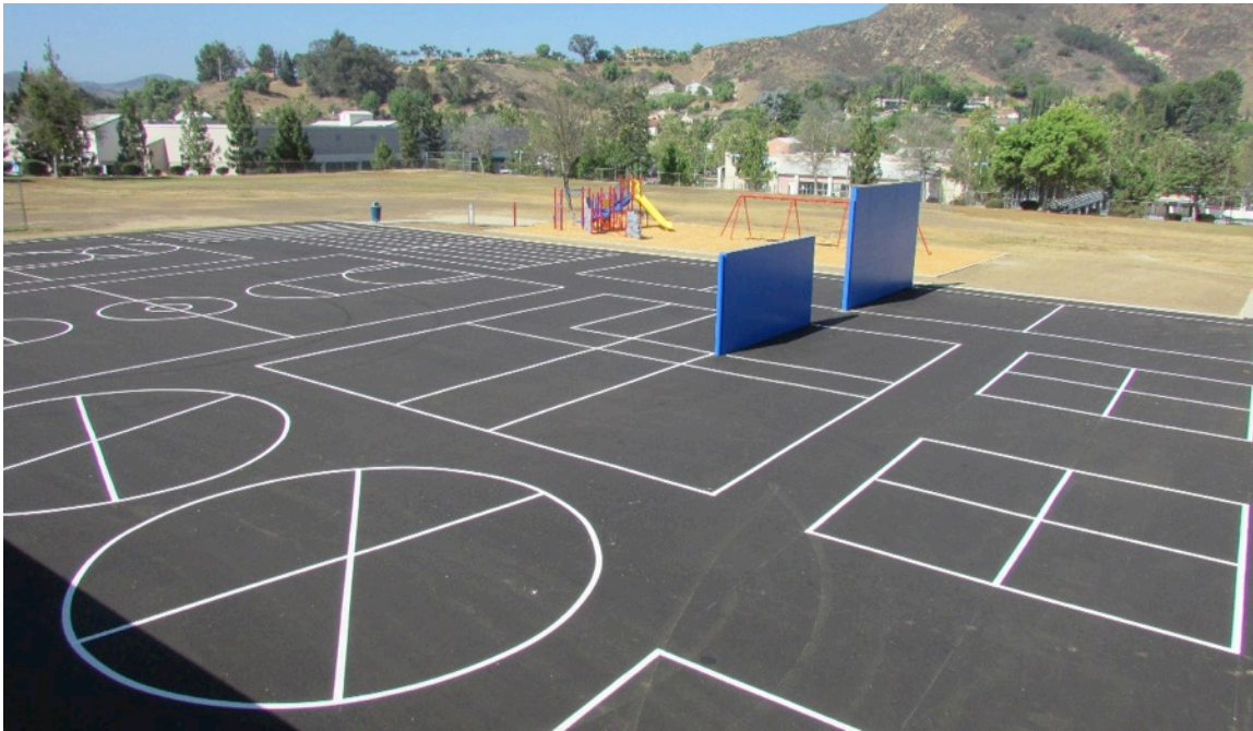
Madera Elementary Playground – New Pavement