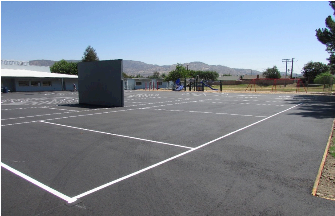
Katherine Elementary Playground – New Pavement