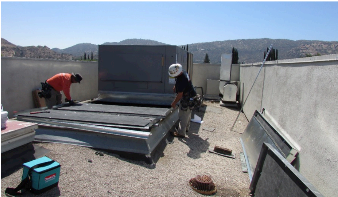
White Oak Elementary School