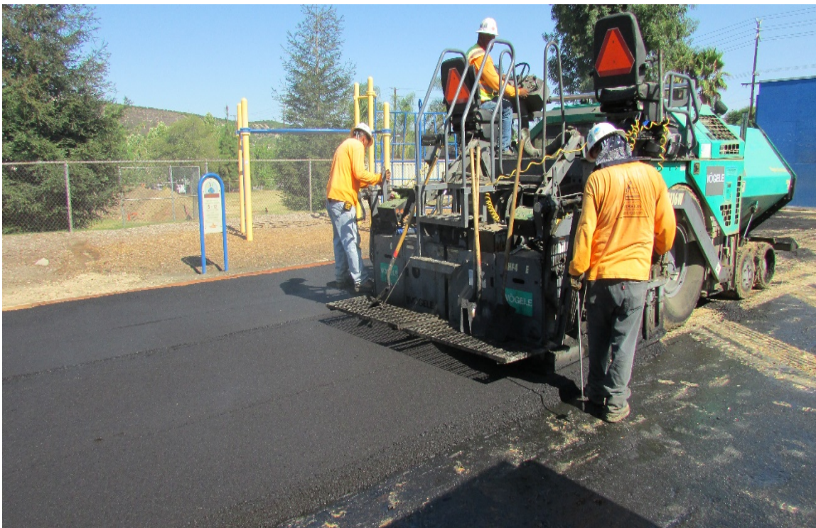
Madera Elementary Playground – New Pavement