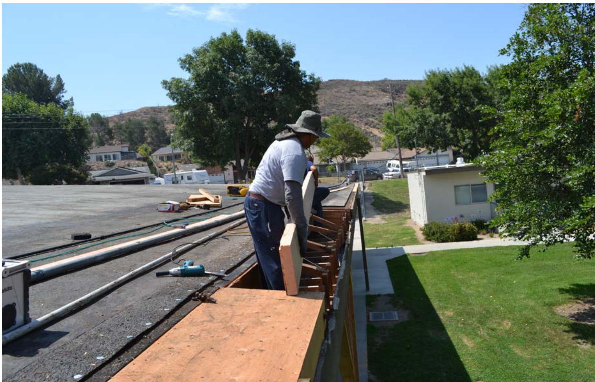
Hollow Hills Elementary School Re-roof