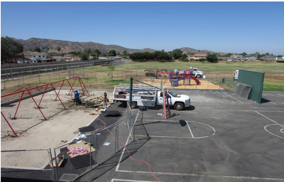
White Oak Elementary- Construction of New Play Equipment