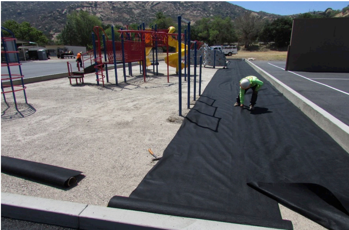
Knolls Elementary Play Equipment