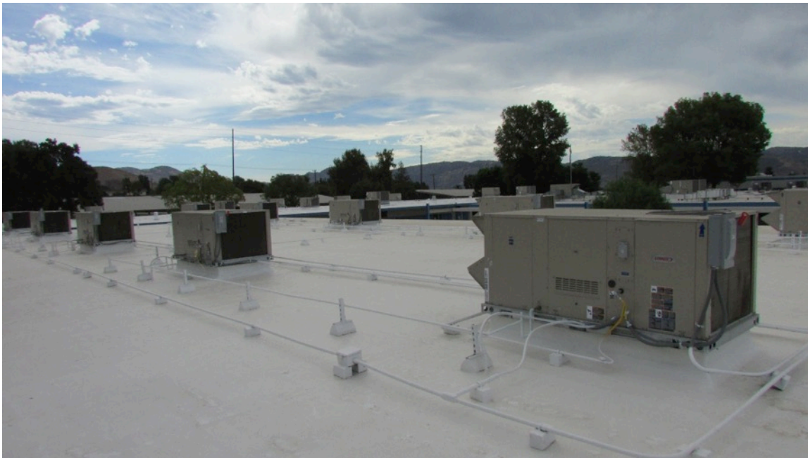
Valley View Middle School – New Air Conditioners & Roofing