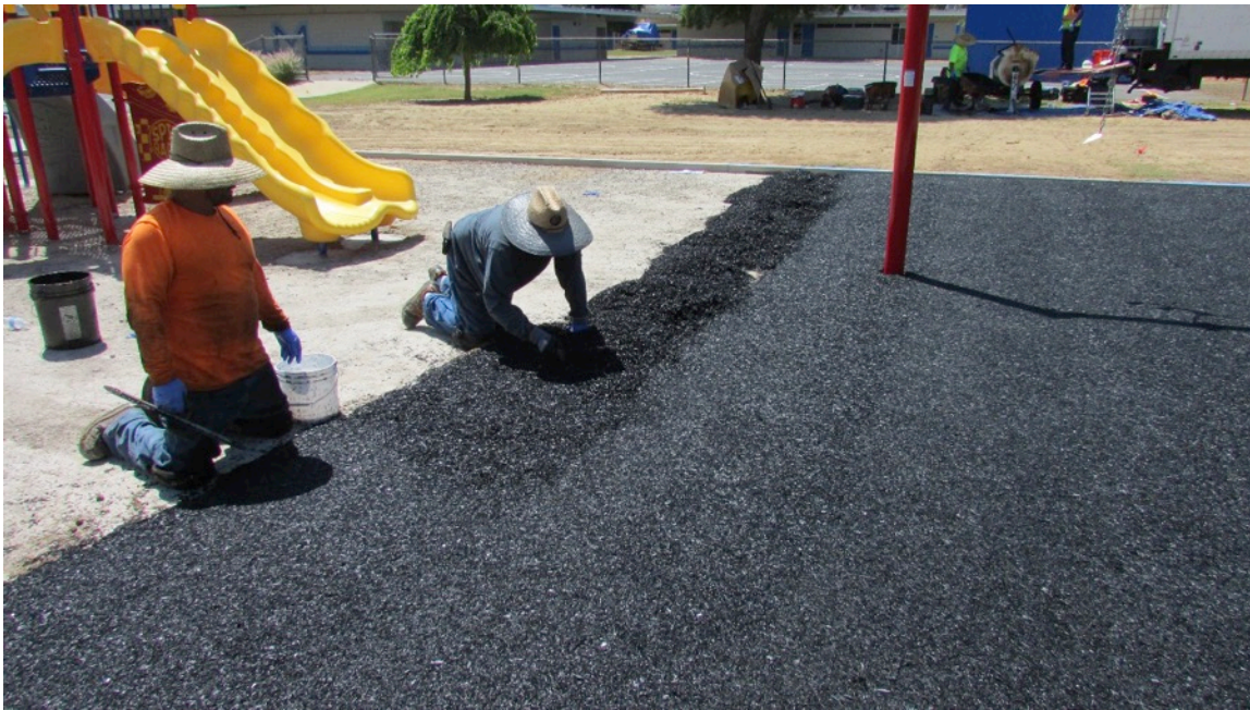
New Rubber Surfacing