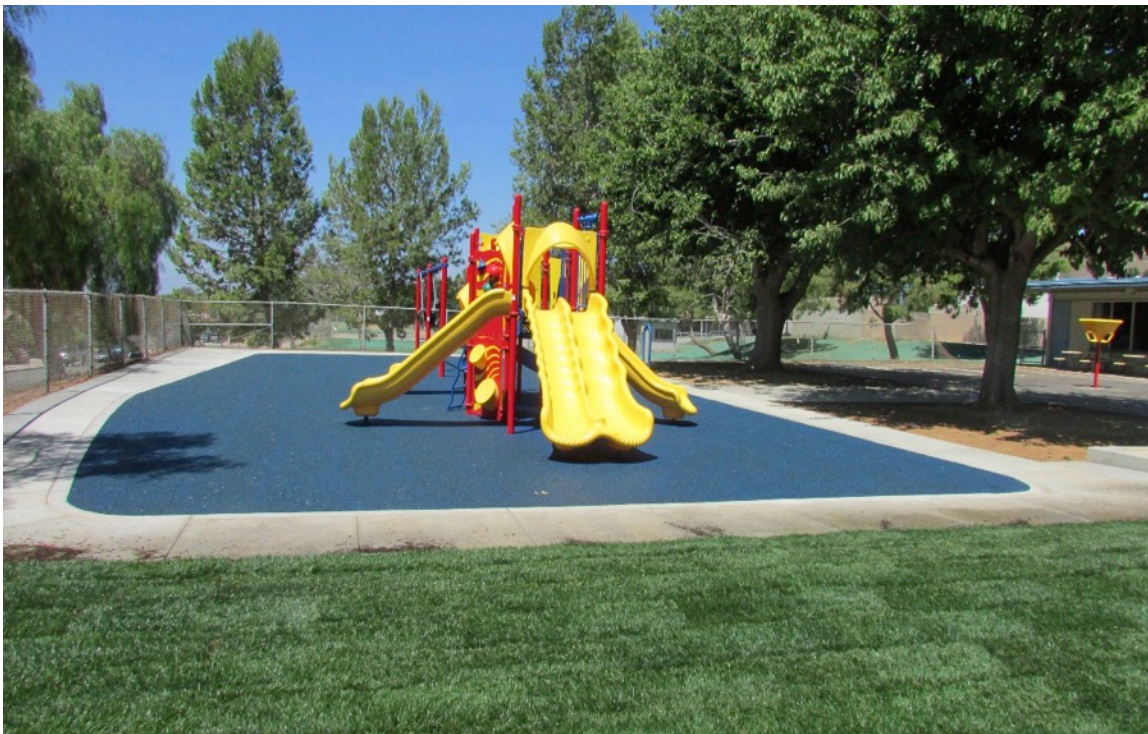
Big Springs Elementary Kindergarten Play Equipment