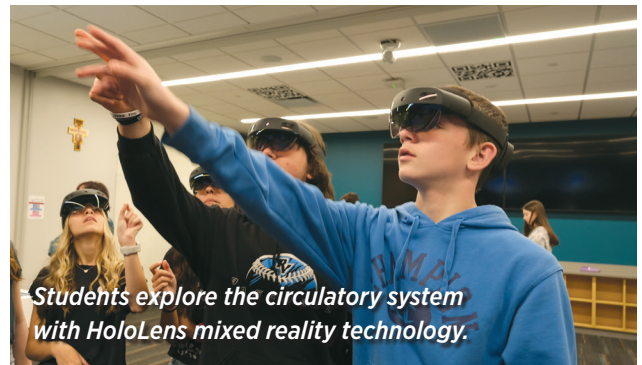
Students explore the circulatory system with HoloLens mixed reality technology.

Learning about existing job opportunities, creating relevance to the real world, and enabling students to map their educational goals to their possible future selves maximizes their investments in post-secondary education and the workforce. With the World of Work framework, students gain experience centered around six careers per grade level. The exposure to different careers helps each student follow a path where their strengths, interests, and values are needed in the workplace. World of Work helps every student see that no matter their skill set, every skill set is valuable, and every person has a place in their community and in the workforce that is needed.