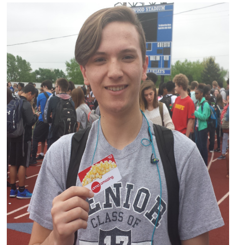
Students display gifts received at celebrations recognizing students' positive behaviors and academic success.