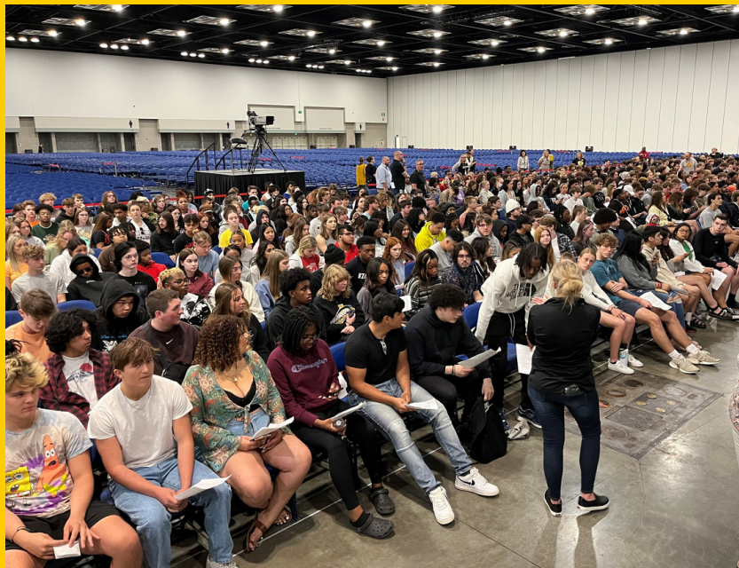
Graduation Practice and Senior Lunch