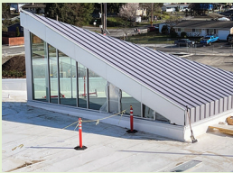
Discovery Lab skylight