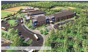
Illahee front entry, parent drop-off

Scholars are expected to move into the new building after Winter Break in January