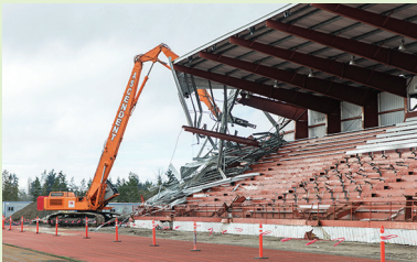
Demolition in progress