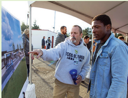
Construction marks the beginning of a new Memorial Field