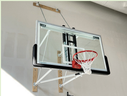
Basketball hoops installed in gym