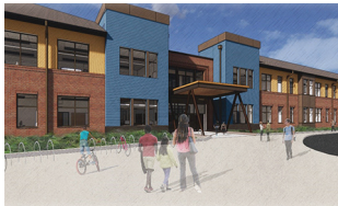
Illahee front entry