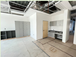
Classroom cabinets and doors in!