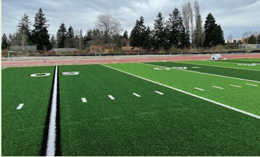
New turf installed