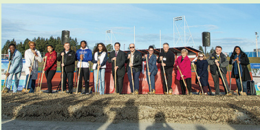
Community comes together to celebrate ground- breaking

Watch the Memorial Field fly-through video!