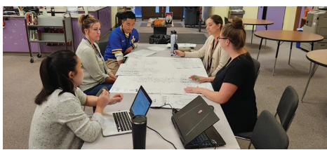
Illahee stakeholder meeting

2025. Look at the updated designs of the new Illahee Middle School and a few photos of the stakeholder meetings which helped inform the building design.