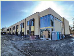
A view of the SW classroom wing