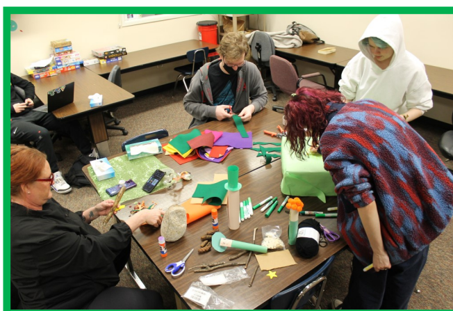
Students working on their leprechaun houses!