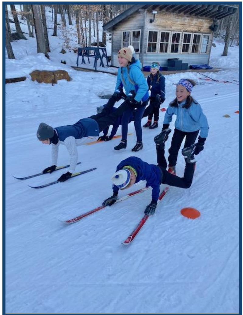
BKL skiers enjoying practice.