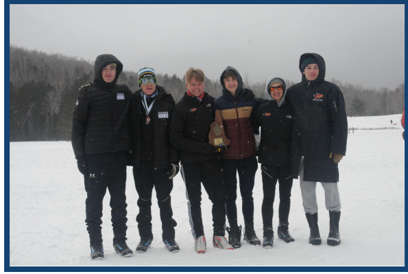
Keene High Skiers celebrated a fantastic championship!

Regionally the Nordic Center was the venue for the Harvard Carnival, which included all the colleges in the EISA and was a qualifier for the NCAA skiing championships. A week later, the New England Nordic Ski Association (NENSA) held a regional qualifier for the Junior National team. Thank you to all who participated and volunteered and for your patience as we had to close the Center to other skiing during these events.