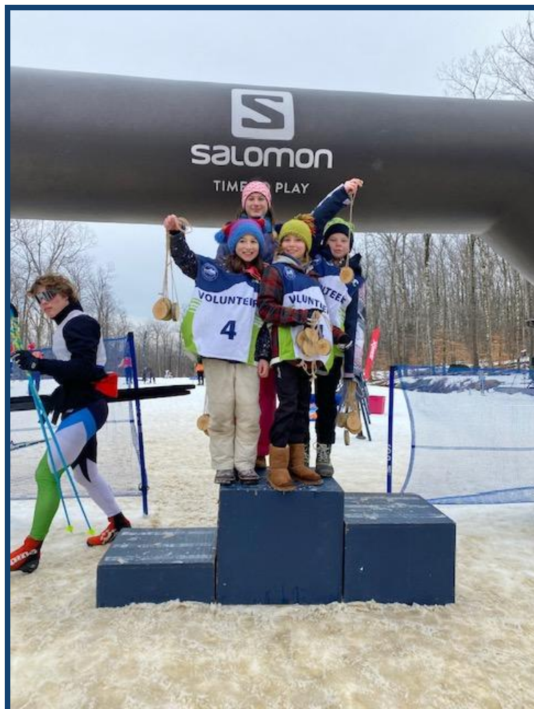
Some young volunteers at the NENSA Eastern Cup

Regionally the Nordic Center was the venue for the Harvard Carnival, which included all the colleges in the EISA and was a qualifier for the NCAA skiing championships. A week later, the New England Nordic Ski Association (NENSA) held a regional qualifier for the Junior National team. Thank you to all who participated and volunteered and for your patience as we had to close the Center to other skiing during these events.