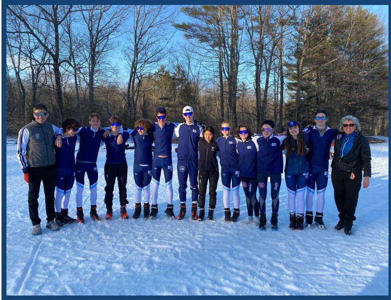
The Dublin School Team had a great season!

Local teams were practicing daily all winter on the lighted loop and beyond. The Dublin School team hosted two races for their league. Keene High and Fall Mountain High hosted races for their New Hampshire high school division. The local club, DublinXC has really grown! The Bill Koch League group of K-8 aged skiers numbered 65 this year! The Junior program traveled all over the region to races. The Masters group hosted workshops and met up to ski together all year. Information about the club can be found on the website at https://www.dublinxc.com/