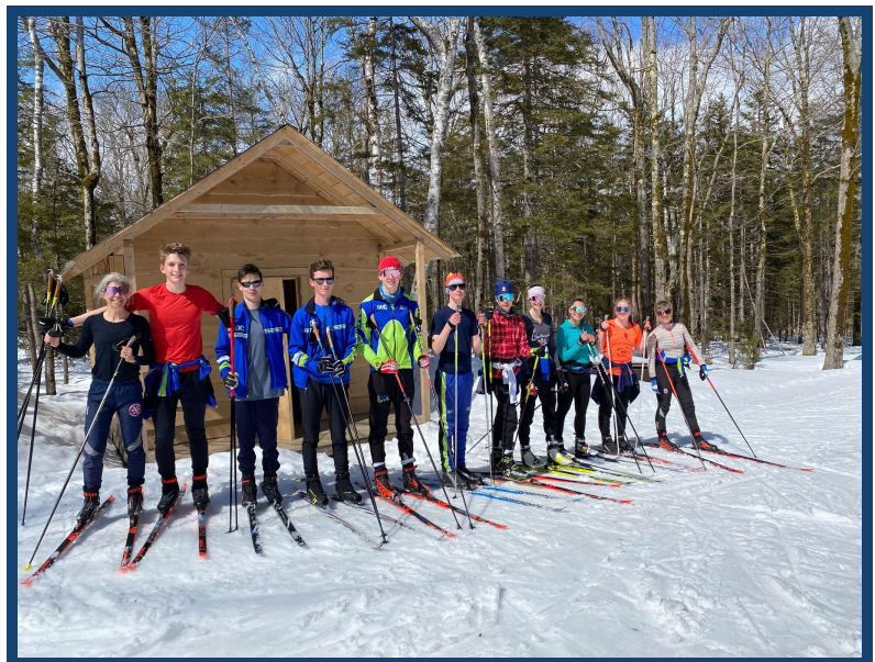
Dublin XC Juniors at practice