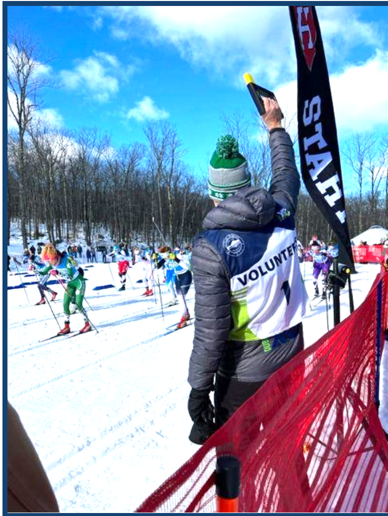
Skiers await the starting gun at the Harvard Carnival