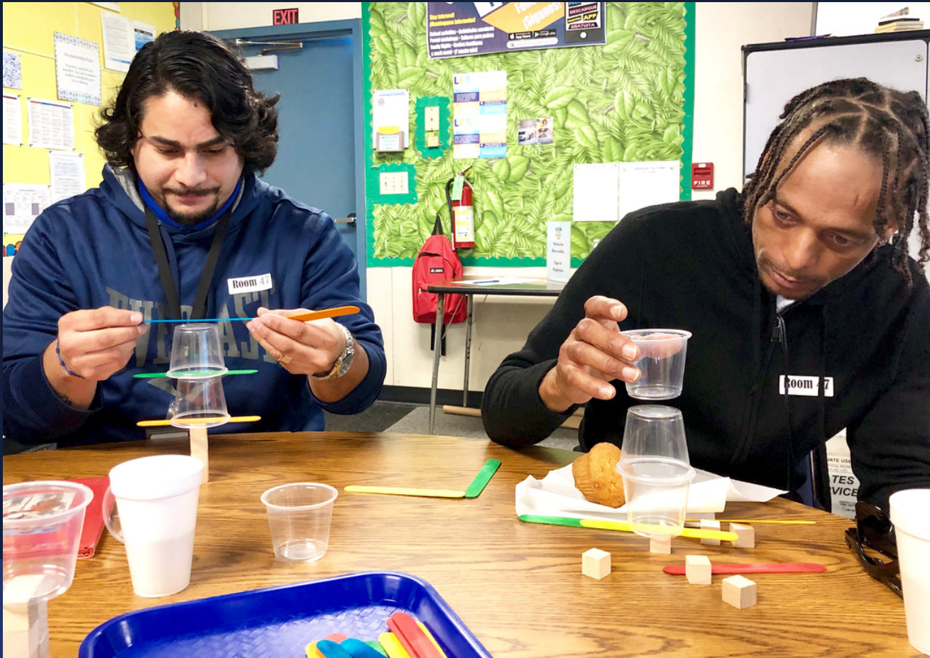
Photo: Math parent workshop.