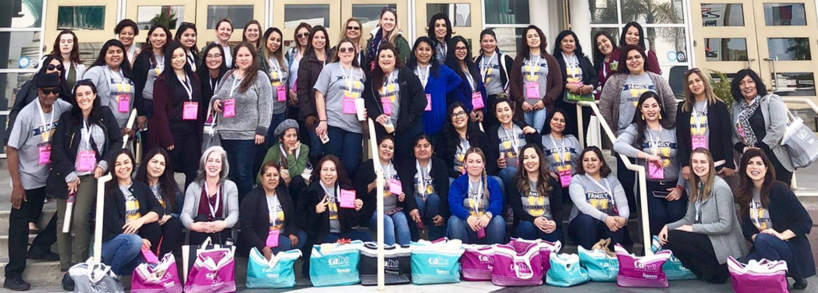
Photo: Parents and staff at the CAFE Annual Conference.