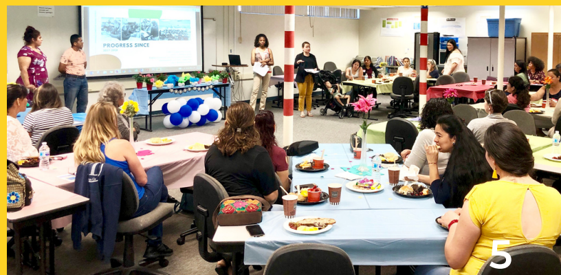
Photo: Parent leaders facilitating district parent advisory committee meetings.