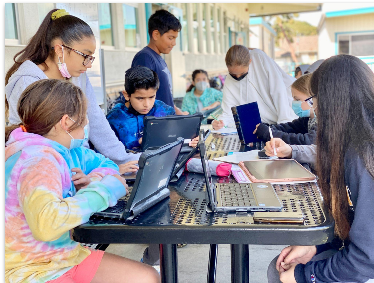
Differentiated small groups