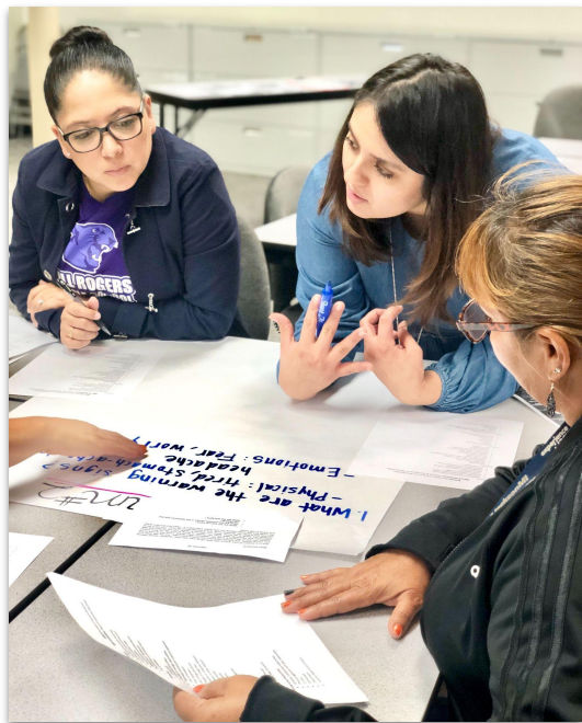
Teacher Lab Days

Increases Teacher Collaboration Provides Time for Intentional Planning for Unduplicated Pupils