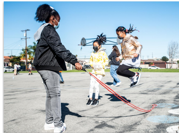
Structured recess activities