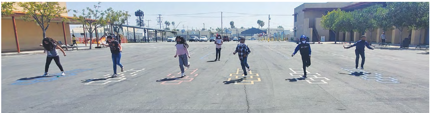
This photo shows some of our 3rd graders enjoying their outdoor break time wearing their masks and keeping social distance while having fun!

For those students who have been able to return to campus, we have had many changes. We have a shortened school day, we have symptom-screening checkpoints before entering campus, and all students must stay with their group the entire time. There are fewer students and small classes, but we are happy to be together in person!