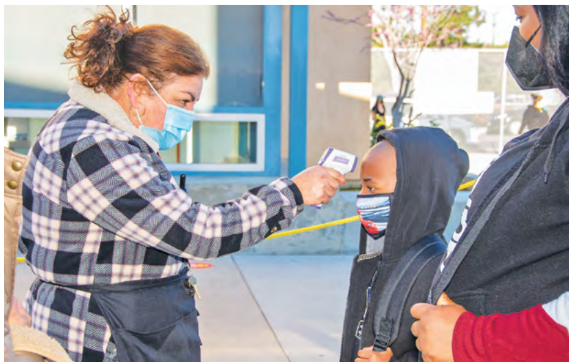
Practicing safety and cleaning protocols at all sites to provide a safe environment for all students and staff.