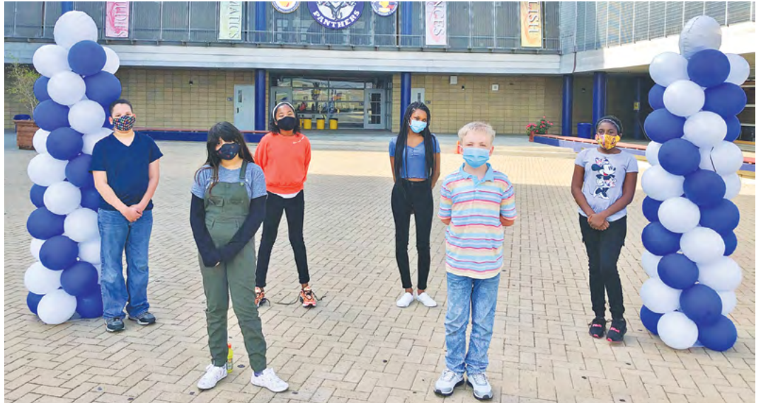
PVMS welcomes back our panthers for in-person instruction!

the risk of transmission. Physical Education and Dance activities are provided outside to accommodate the active nature of those courses, while also maximizing safety. Together we will be stronger and better, and always a home to our Panthers!