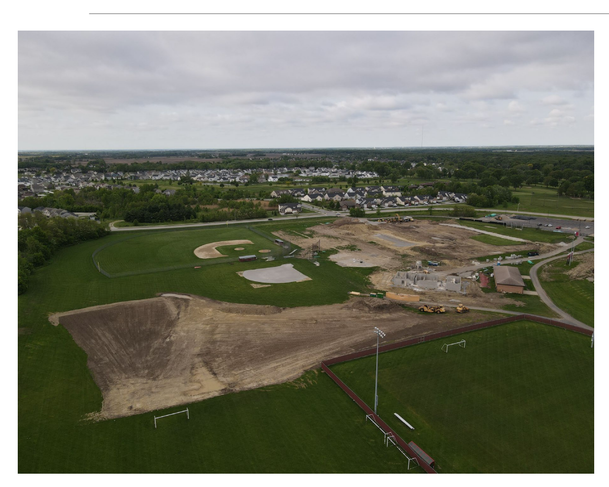
Athletic Field Prep