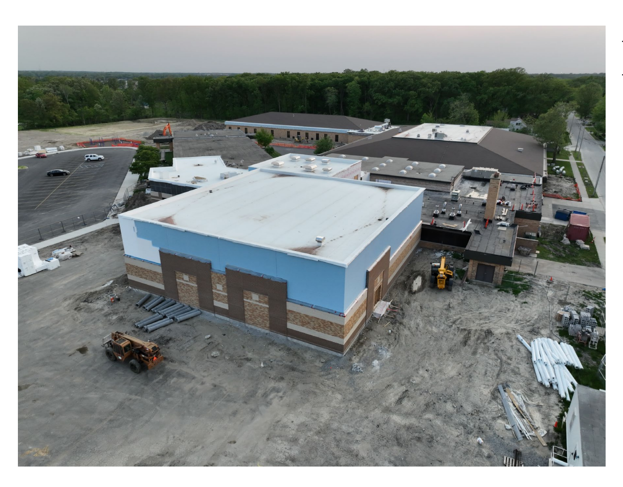
Ariel View of Gym