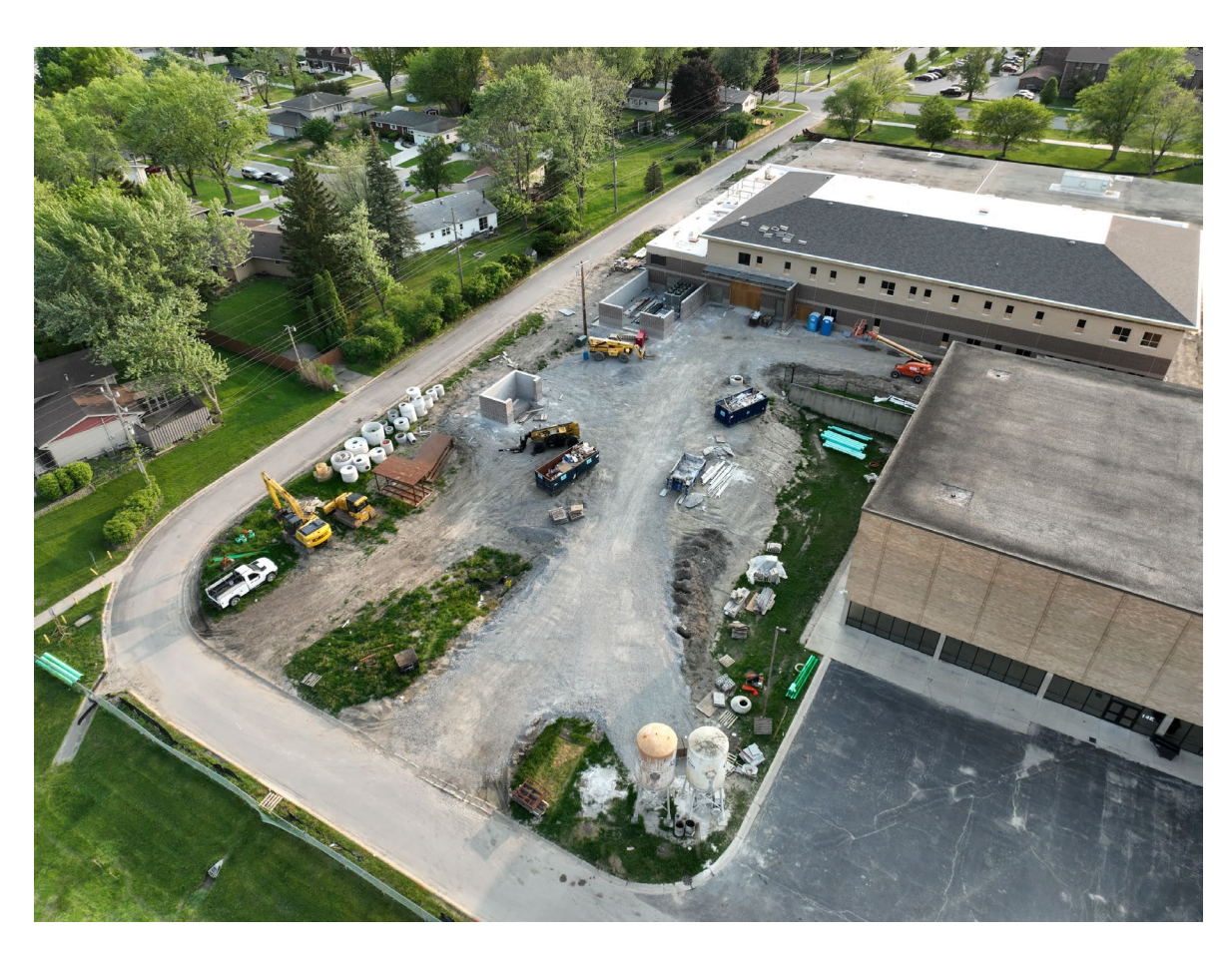
New Administration Side View