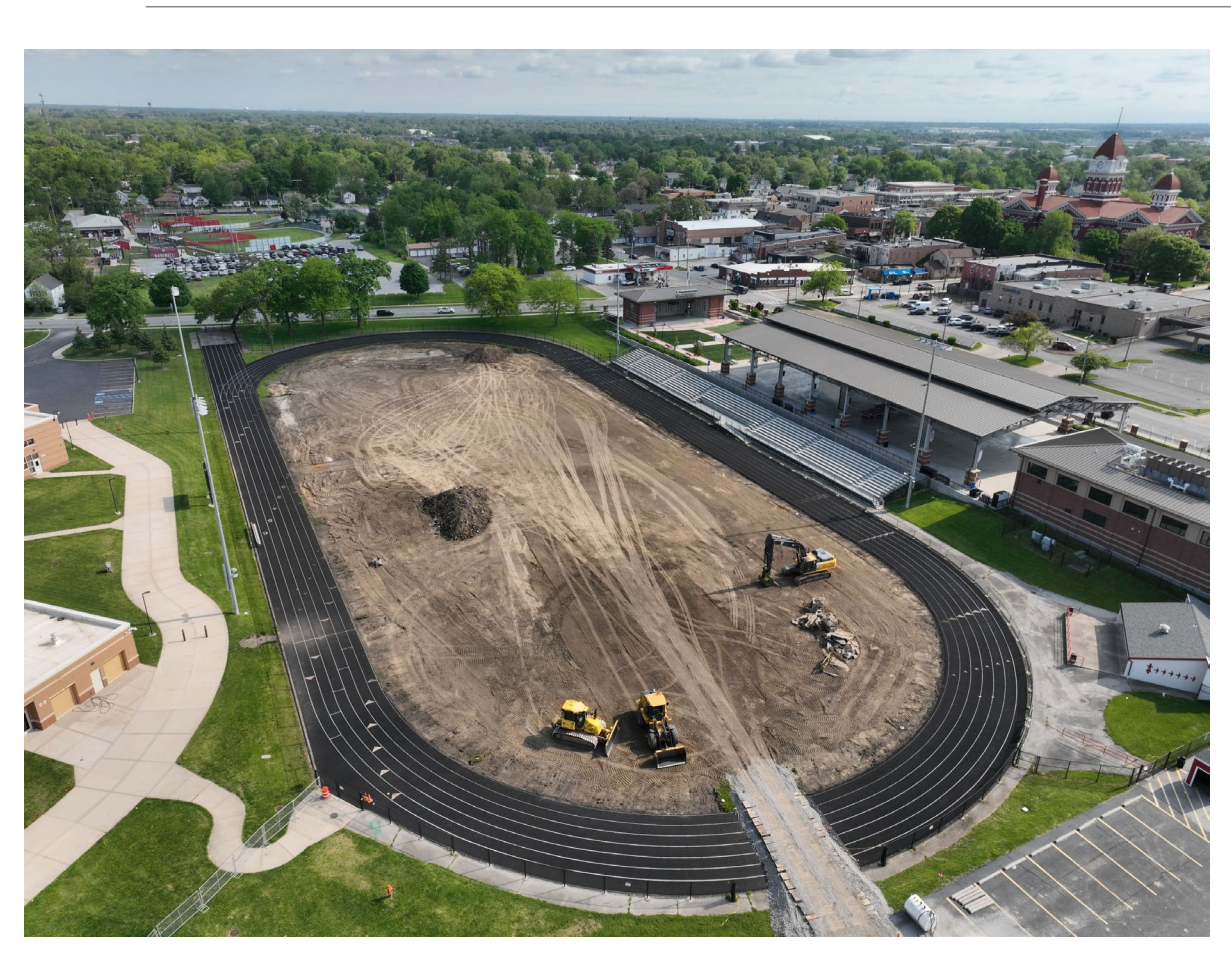
Ariel View of Football Field Demo