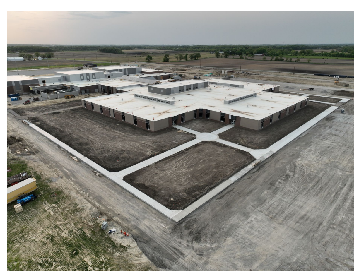
Sidewalks and Pavement Prep