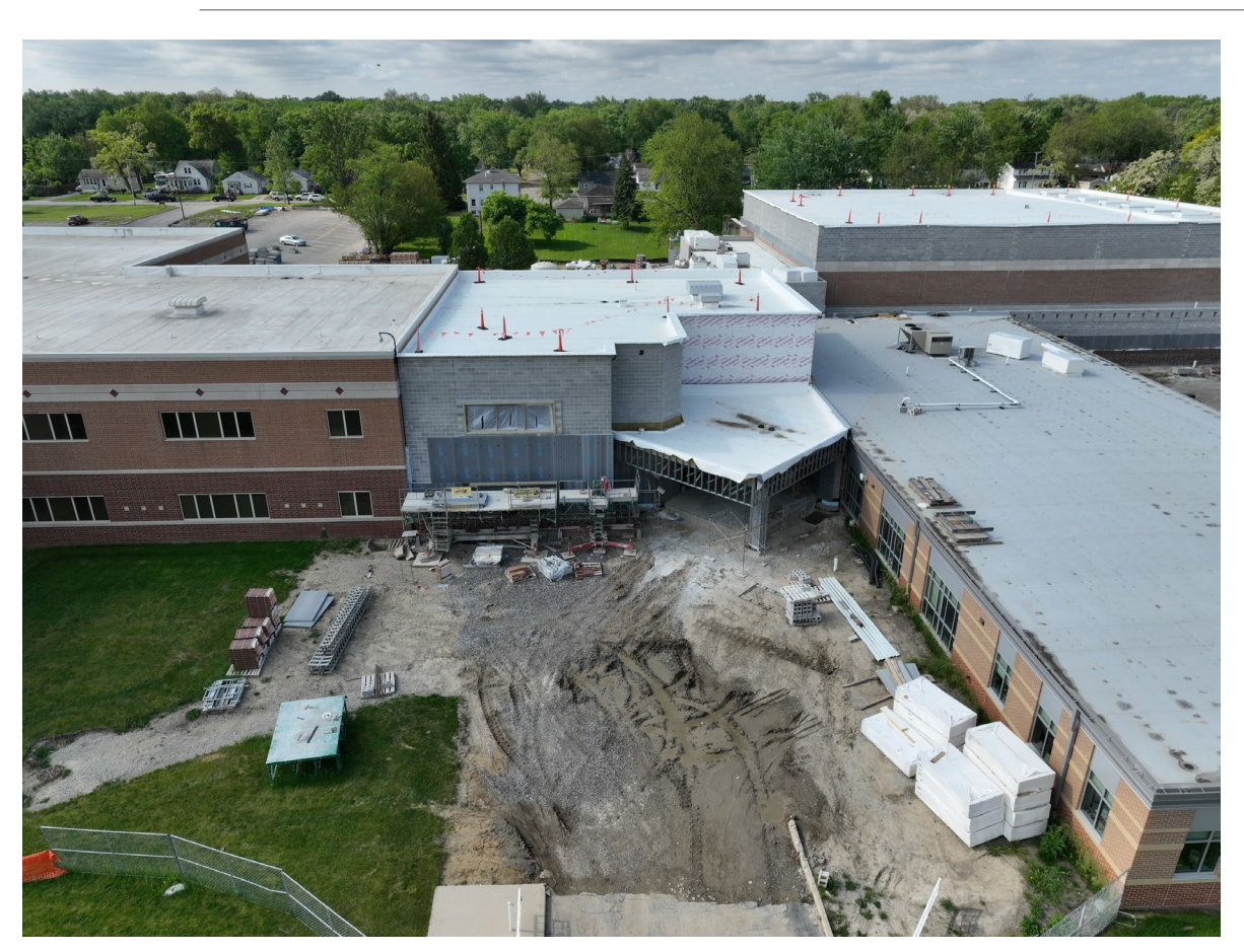
Classroom Addition Exterior