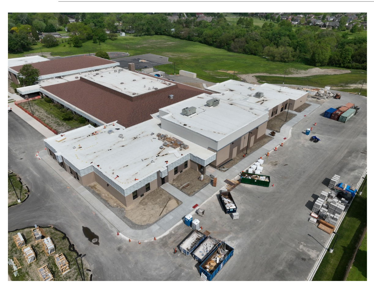
East Side Additions