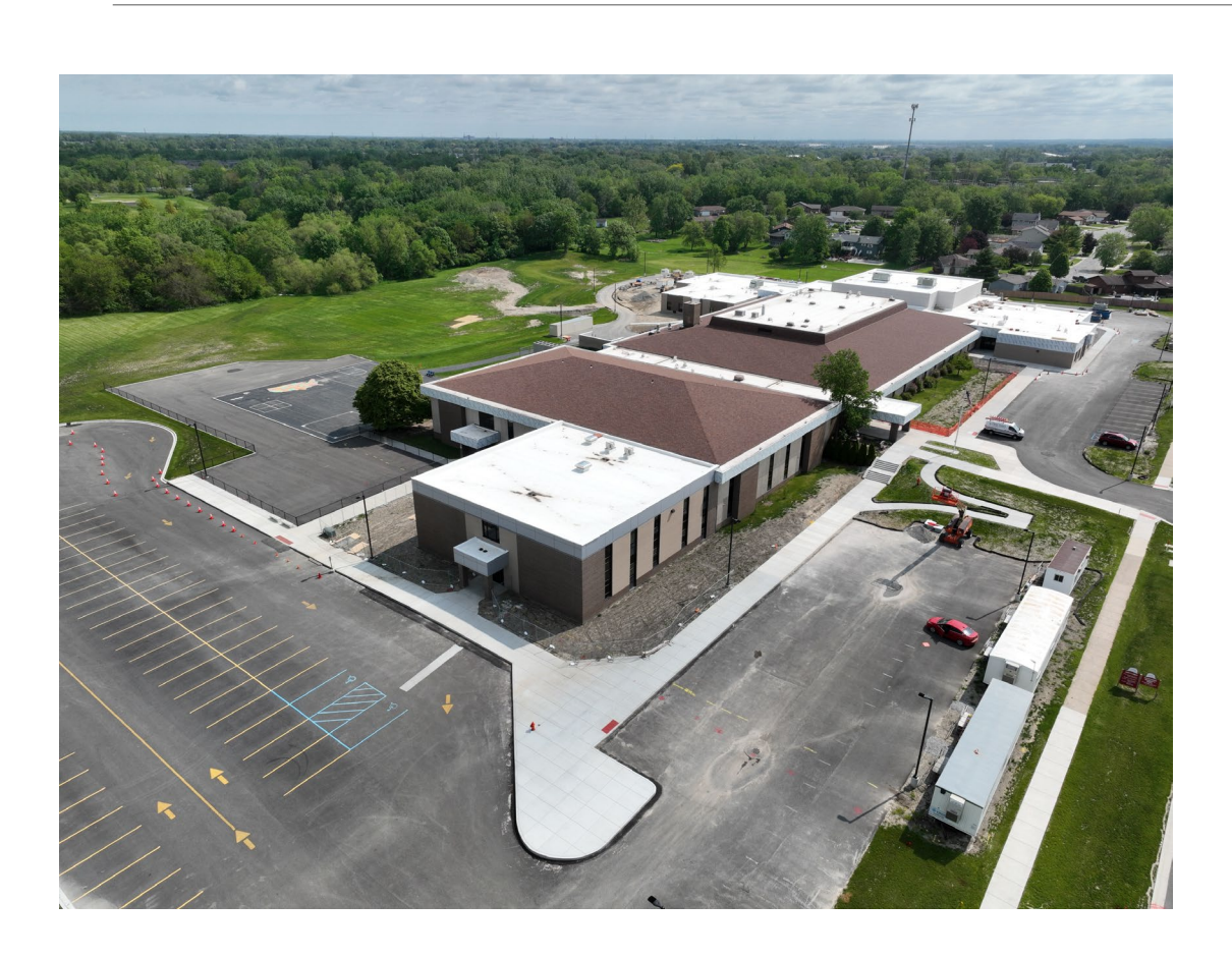
Ariel View of Classroom Addition