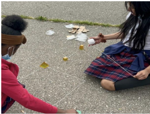
A Win Win Situation!: 6th & 7th graders were using their outdoor time to engage in Math! Way to go, Scholars!