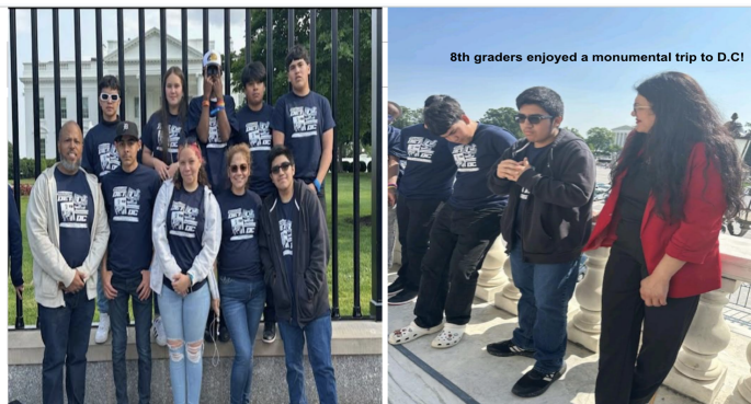
8th graders enjoyed a monumental trip to D.C!

law states that third graders may repeat third grade if they are more than one grade level behind, and not being proficient on the M-Step.