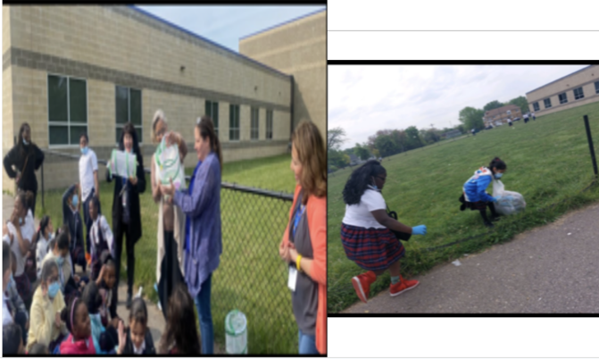
Butterfly Release & Scholars Cleaning the Playground! Way to go, Scholars!