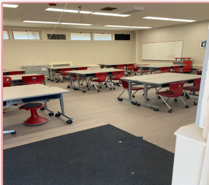
Los Altos ES