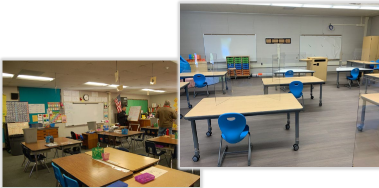
Mesa Robles – Construction Completed