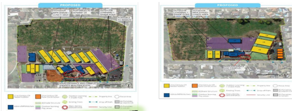
Grandview Academy – Under Construction