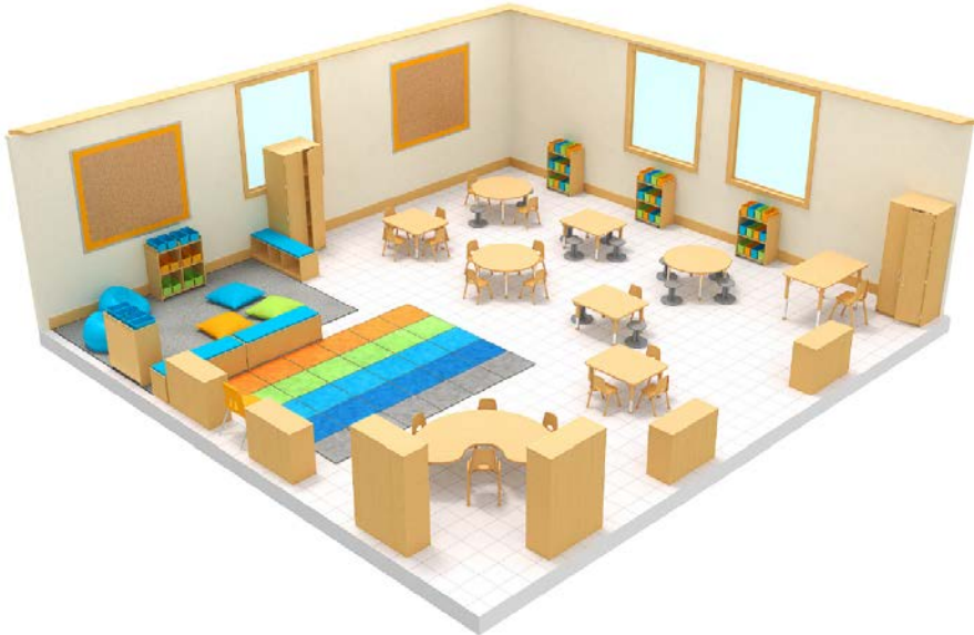
Lakeshore® COMPLETE CLASSROOM® FOR HACIENDA LA PUENTE – TRANSITIONAL KINDERGARTEN VERSION 3