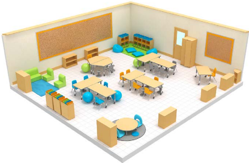
Lakeshore® COMPLETE CLASSROOM® FOR HACIENDA LA PUENTE – THIRD GRADE VERSION 2