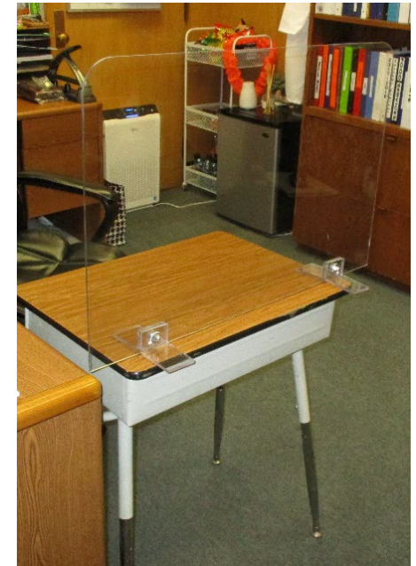
A/P Portable Desk