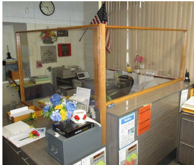
Office Manager's Desk