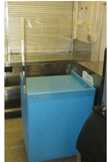
Kitchen Register Cart