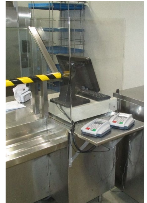
Kitchen Register Cart