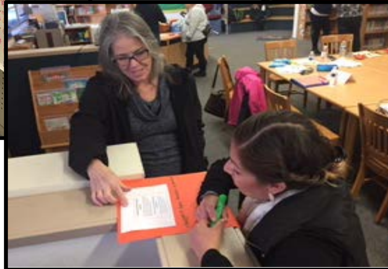
SDM at Baldwin Elementary School