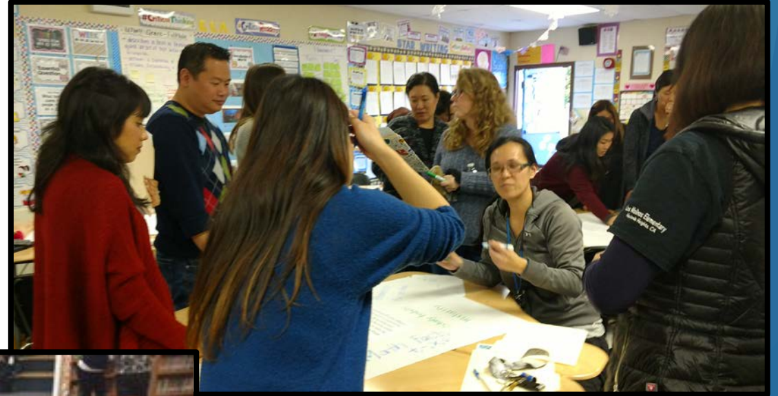
Los Molinos Elementary School