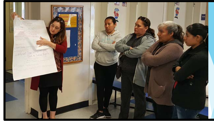
Del Valle Elementary Parent Engagement