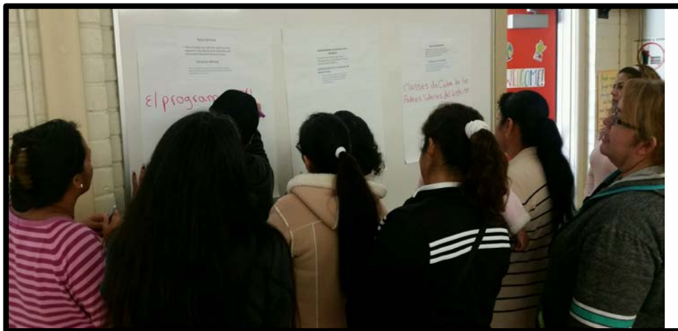
Los Molinos Elementary Parent Engagement