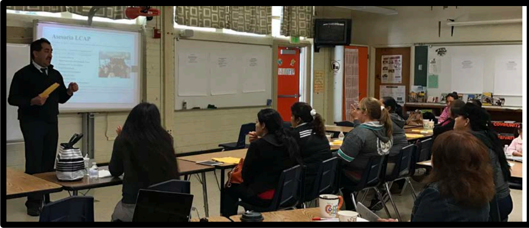
Parent LCAP Meeting at La Puente HS