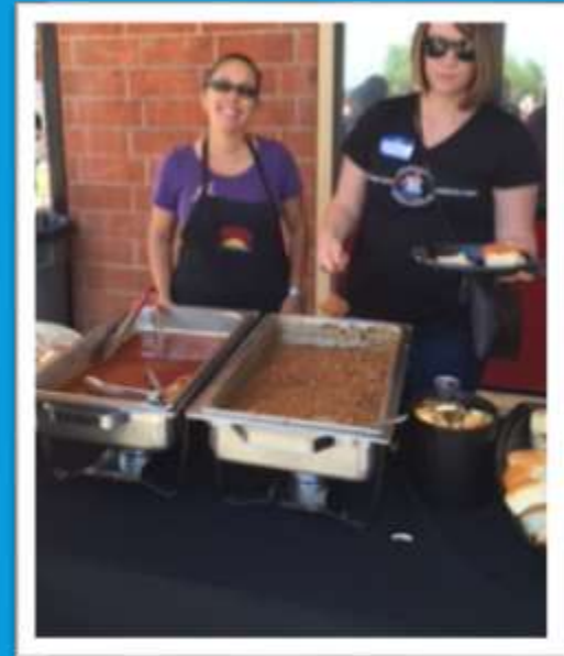
Adult Education/IRS served breakfast and lunch for all attendees