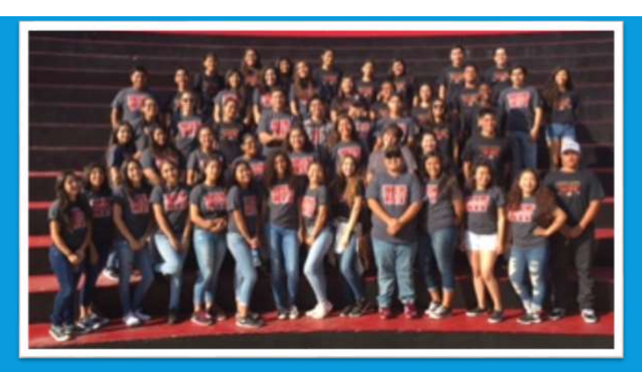
ASB and Renaissance Students Welcomed District Teachers and Administrators