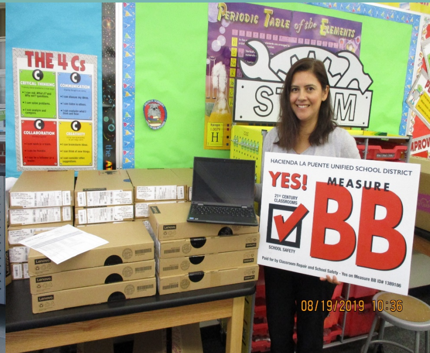
Baldwin 8/19/19 Teacher Laptop Delivery