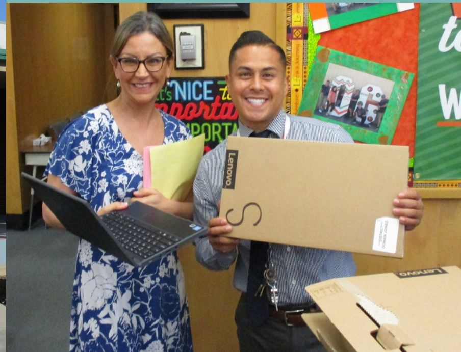
Orange Grove MS 8/19/19 Teacher Laptop Delivery