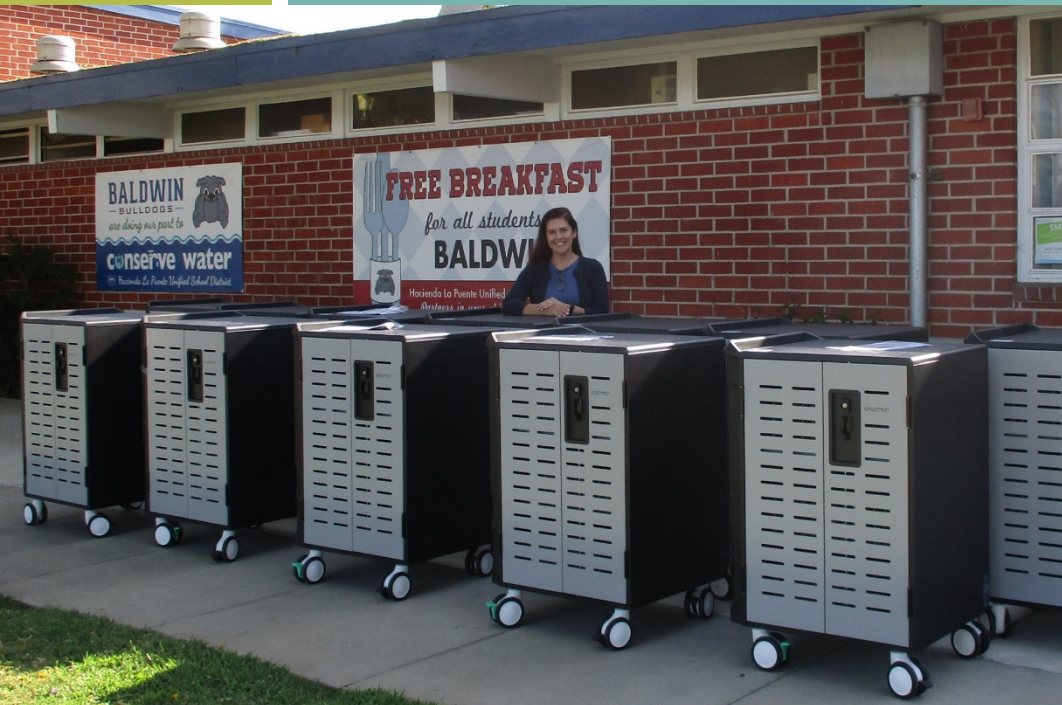
Baldwin 8/26/19 Classroom Laptop Cart Delivery