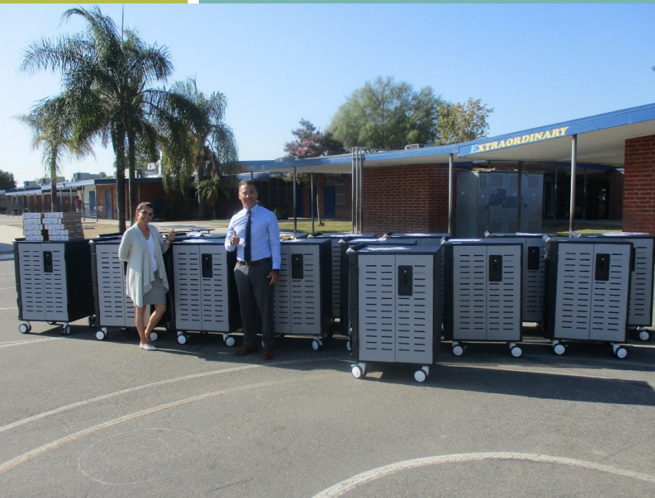
Lassalette 8/27/19 Classroom Laptop Cart Delivery