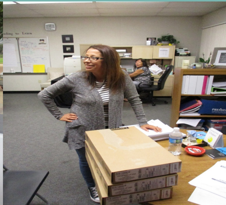
Palm 8/19/19 Teacher Laptop Delivery