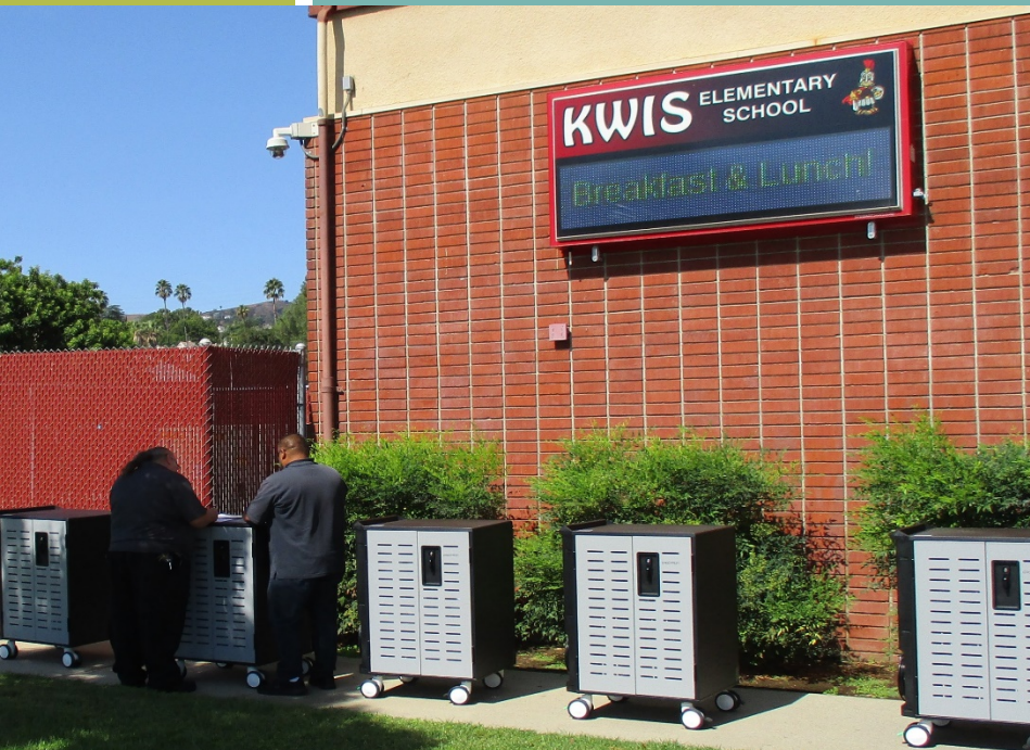
Kwis 8/26/19 Classroom Laptop Cart Delivery