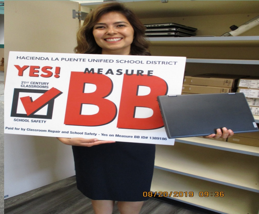
Sparks MS 9/20/19 Teacher Laptop Delivery