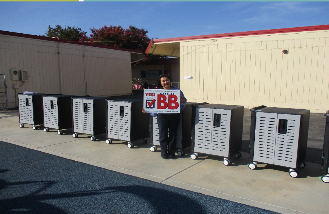
Wedgeworth 9/24/19 Classroom Laptop Cart Delivery