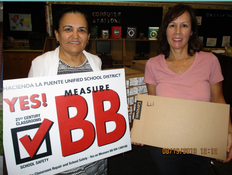
Sierra Vista 9/19/19 Teacher Laptop Delivery