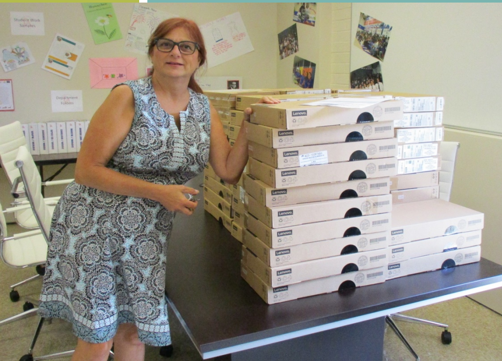
Los Altos High School 9/12/19 Classroom Laptop Cart Delivery