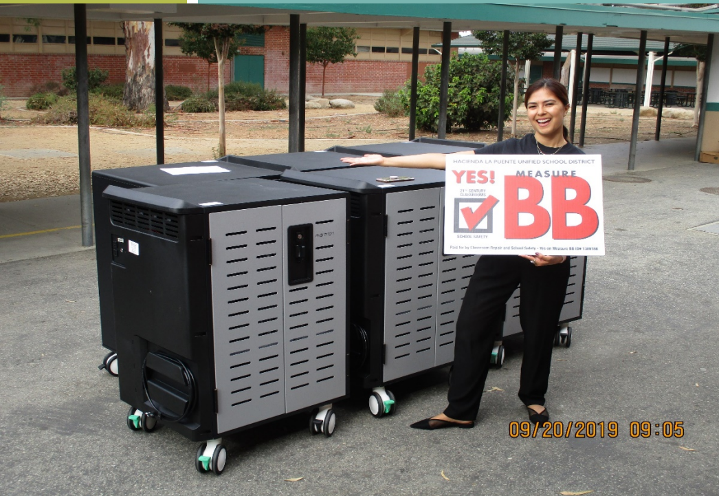
Sparks MS 9/20/19 Classroom Laptop Cart Delivery