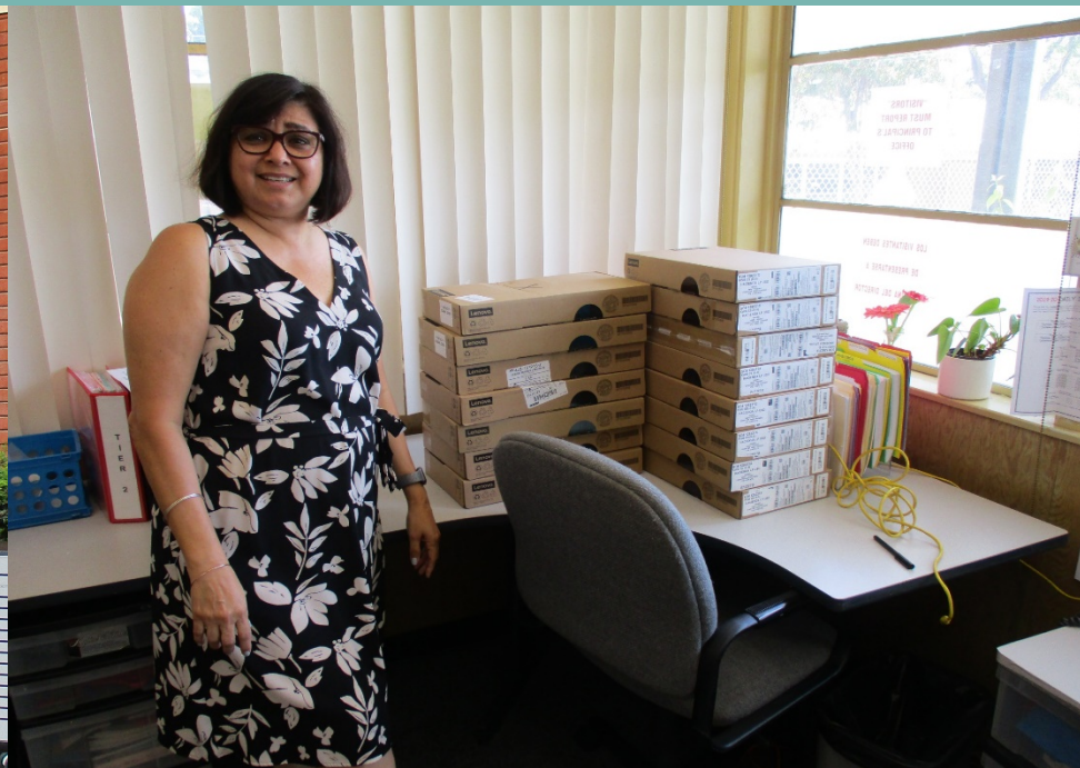
Kwis 8/19/19 Teacher Laptop Delivery