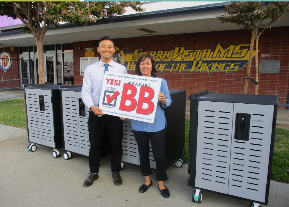
Sierra Vista 9/19/19 Classroom Cart Delivery