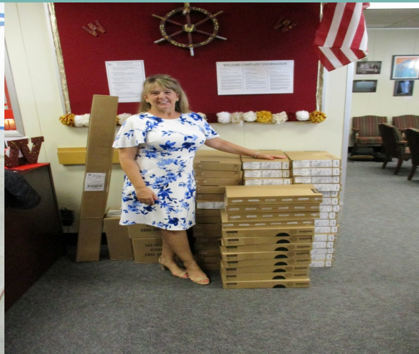
Wilson HS 9/18/19 Teacher Laptop Delivery