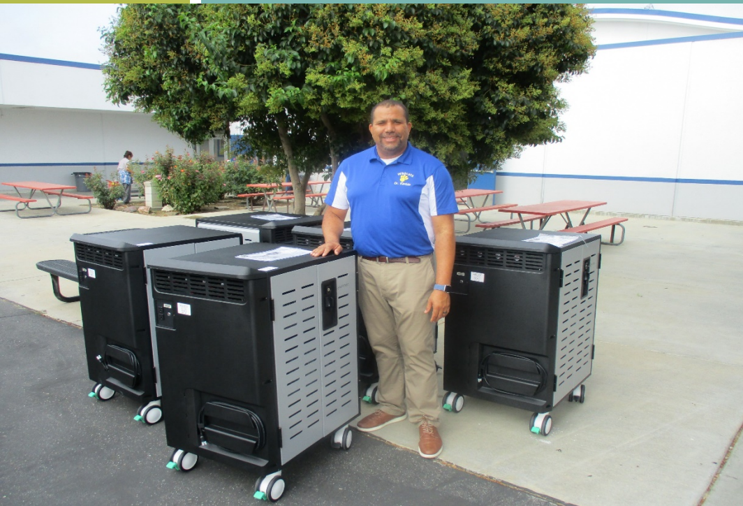
Bixby 8/28/19 Classroom Laptop Cart Delivery