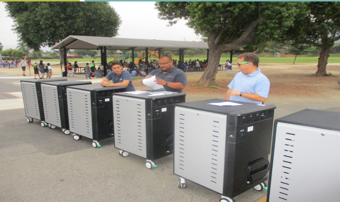
Palm 9/28/19 Classroom Laptop Cart Delivery