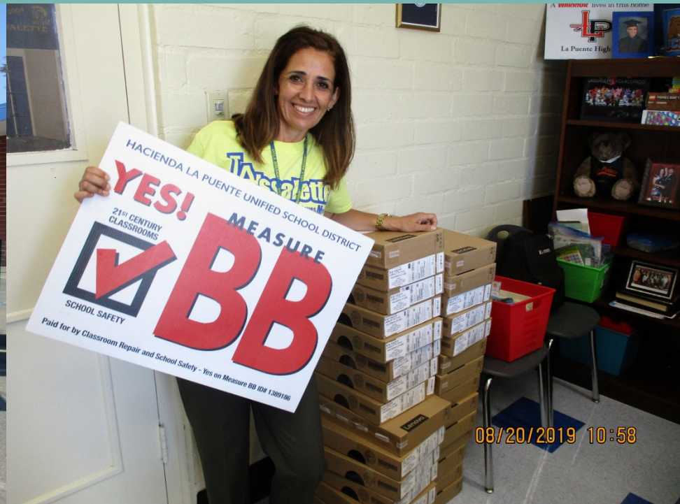
Lassalette 8/27/19 Teacher Laptop Delivery