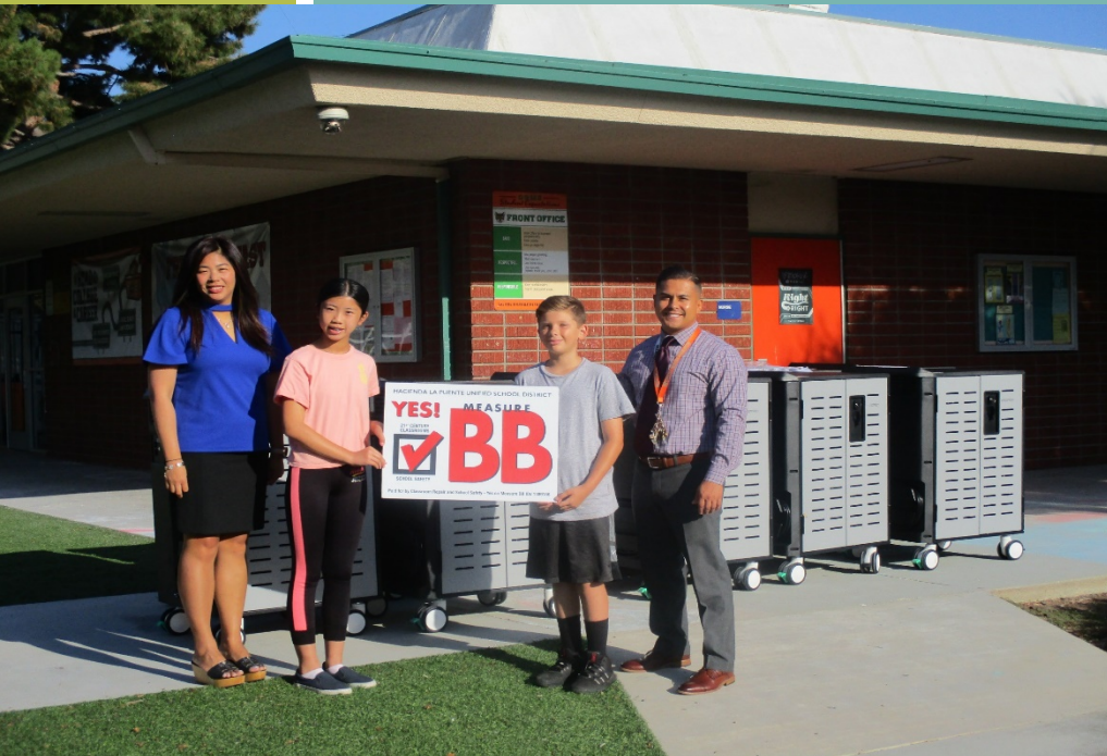
Orange Grove MS 9/23/19 Classroom Laptop Cart Delivery