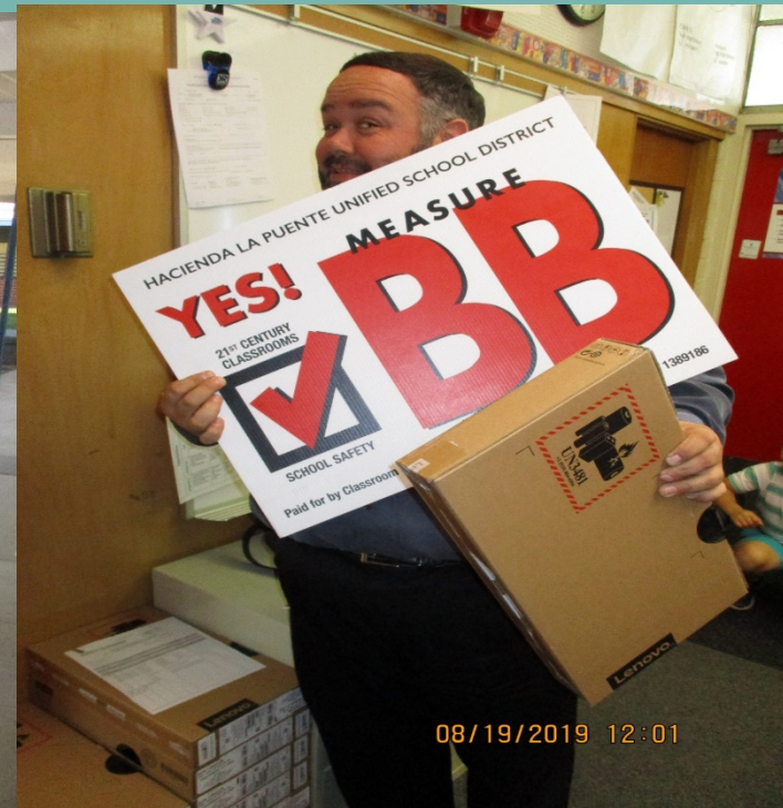
Del Valle 8/19/2019 Teacher Laptop Delivery