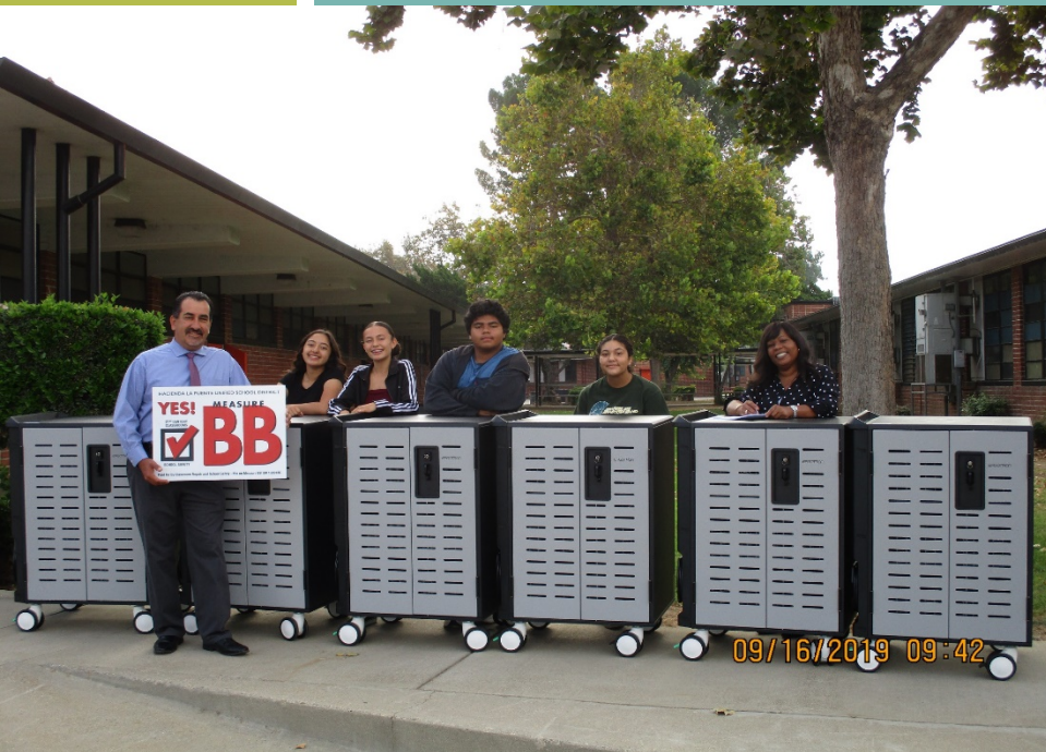
La Puente High School 9/16/19 Classroom Laptop Cart Delivery