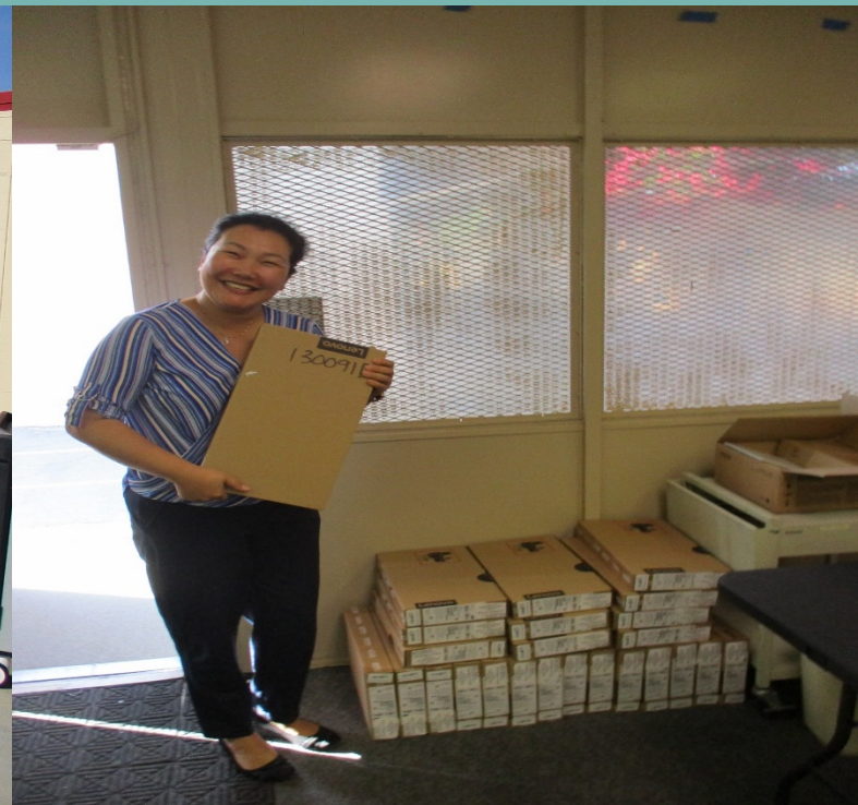
Wedgeworth 8/20/19 Teacher Laptop Delivery