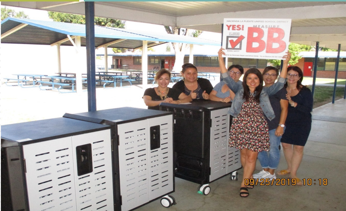
Del Valle 9/25/2019 Classroom Laptop Cart Delivery