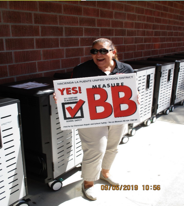
Workman HS 9/6/19 Classroom Cart Delivery