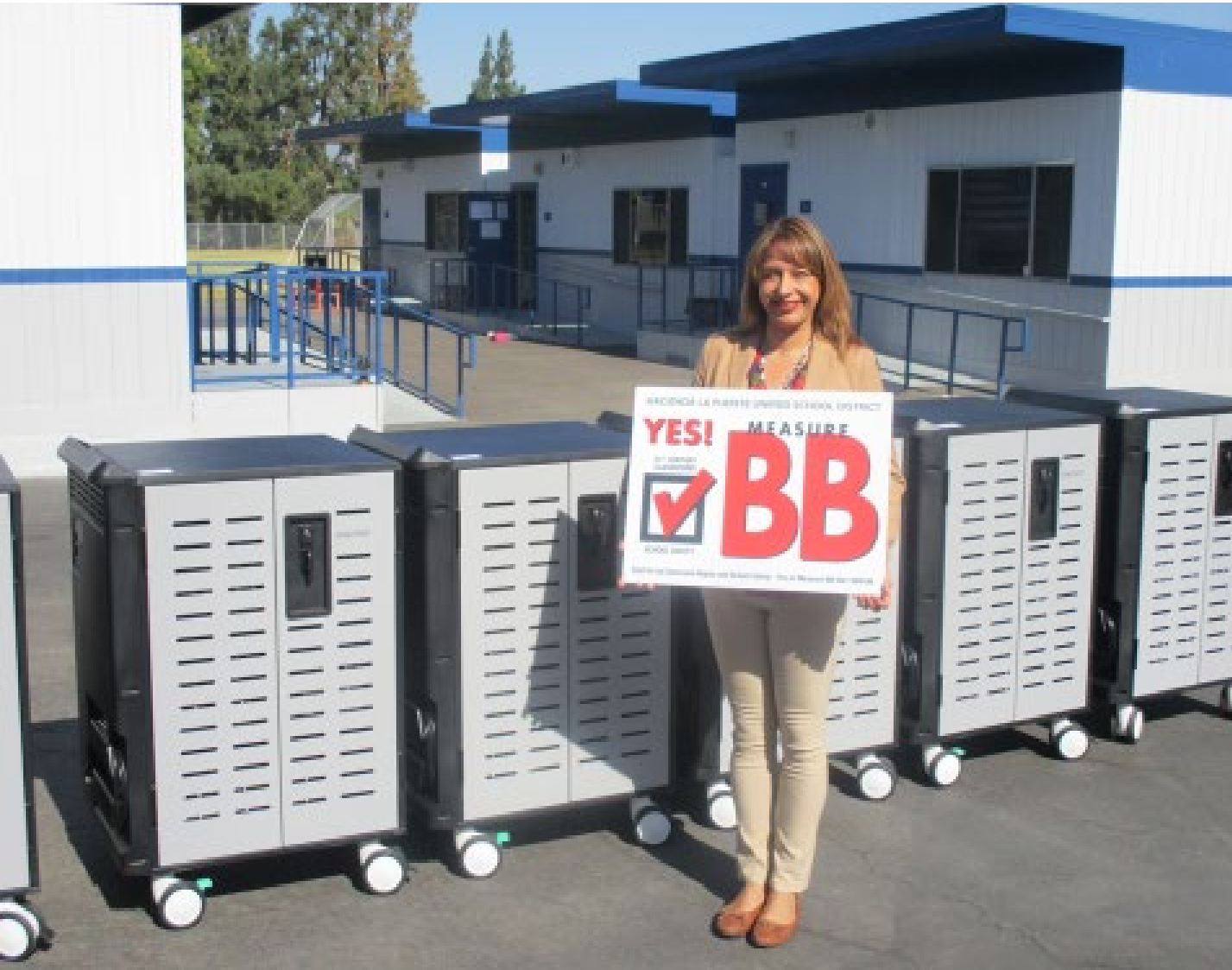
Los Molinos Elementary School