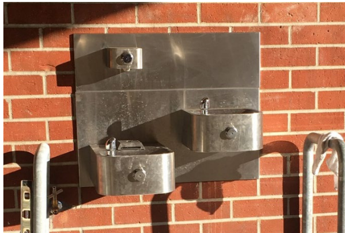
Wing Lane Bottle Filing Station