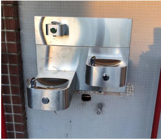
Amar Bottle Filing Station