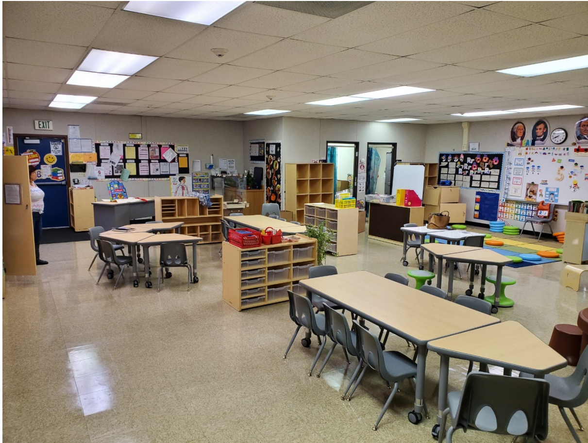
Bixby's preschool bond project renovations