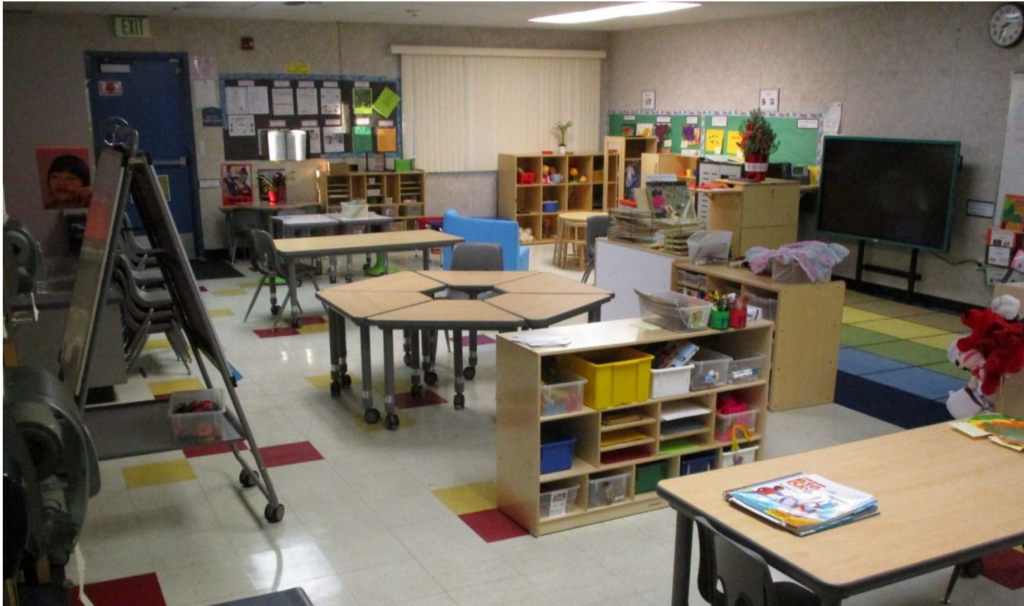
Nelson's preschool bond project renovations