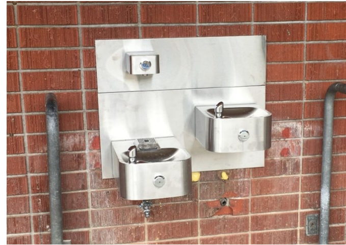
Mesa Robles Bottle Filing Station