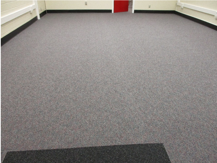
D9 Carpet Replacement