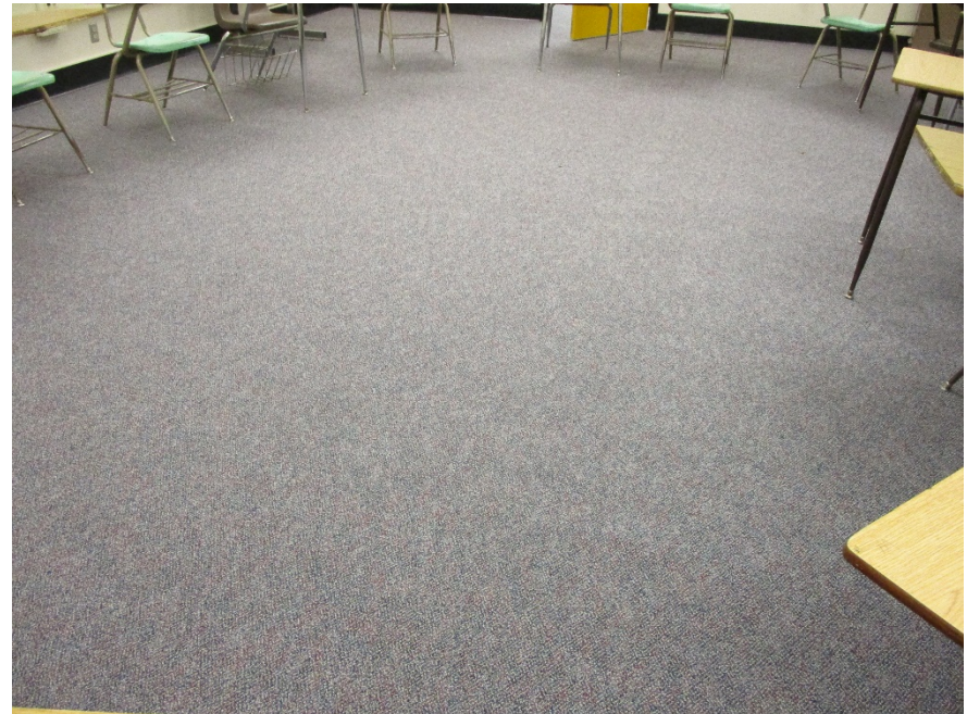
D12 Carpet Replacement