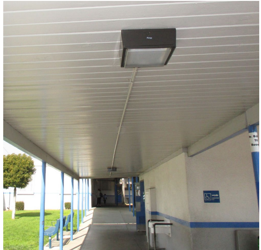
Newly installed lighting