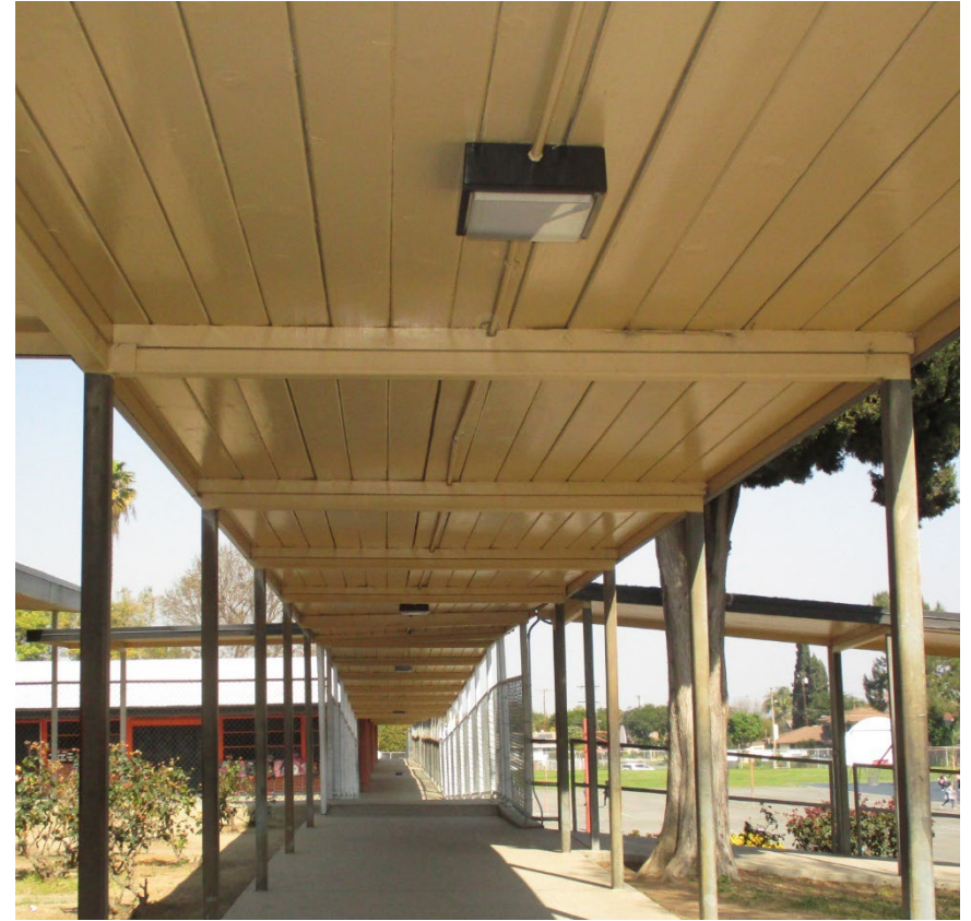
Newly installed lighting