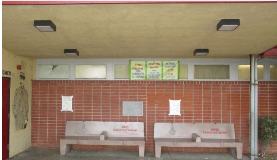
Newly installed lighting