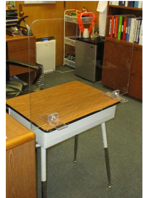
A/P Portable Desk