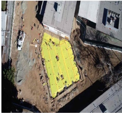
La Puente HS New Kitchen