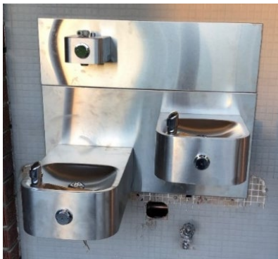
Bottle Filling Stations