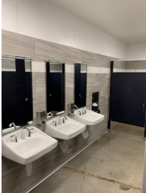
La Puente HS Pool