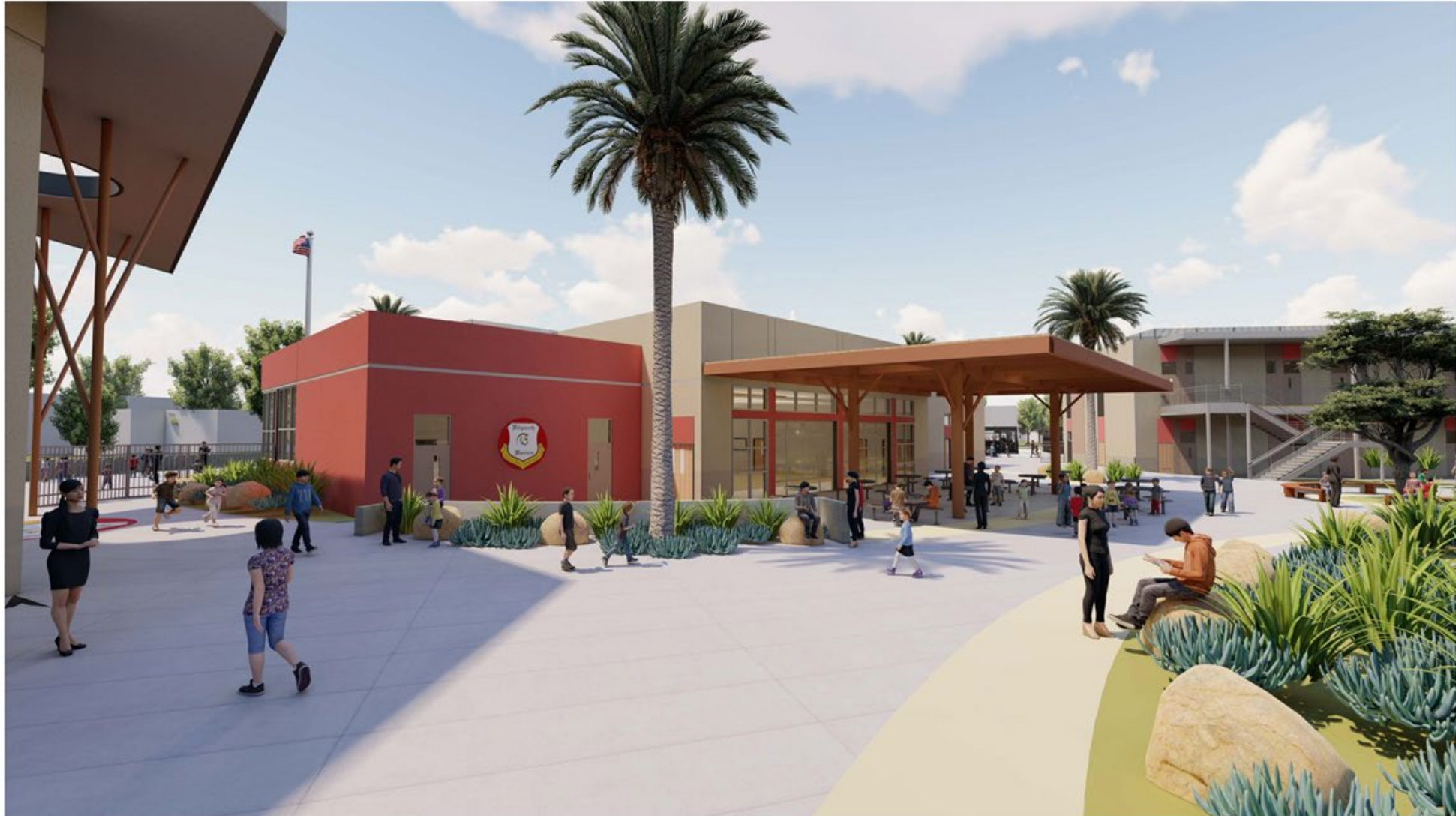
Courtyard View to MPR