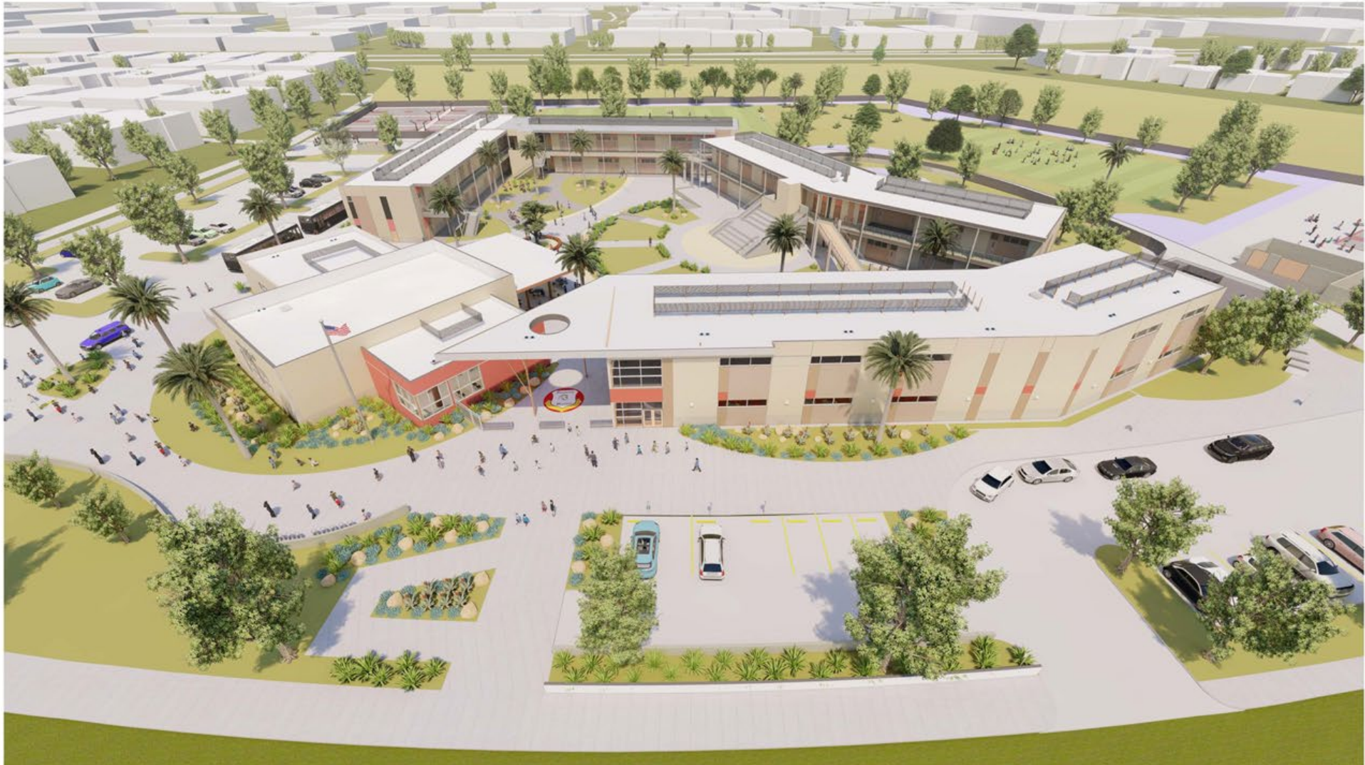
Birdseye View from South