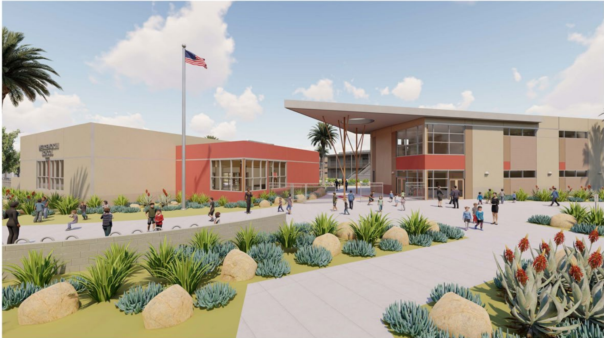
Main Front Entry to South