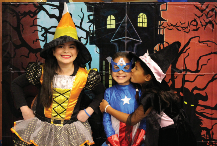
The district's Halloween Fun Fair was a spook-tacular time for witches, goblins, ghosts, princesses, and superheroes of all ages.