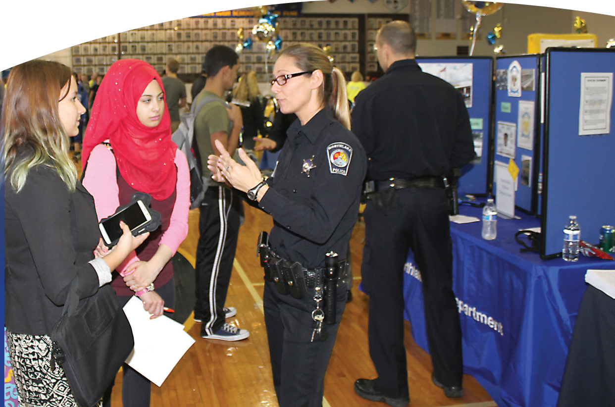
The 9th Annual Career Fair and Business Expo included nearly 100 vendors and attracted about 1500 visitors seeking employment.