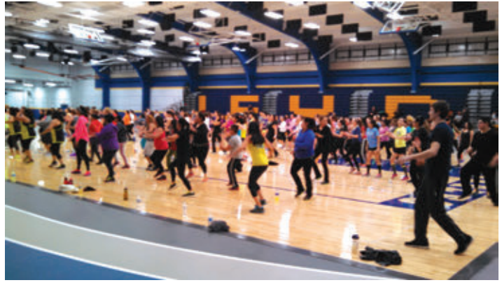
Leyden's Service Club, the Boys Track Team, and the Girls Track Team hosted a Zumbathon charity event on February 20, 2015, in the field house at the West campus. The event raised $1,730 for the club and track teams.