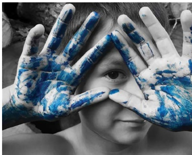
Xitlali Hernandez Splash the Blue Photography