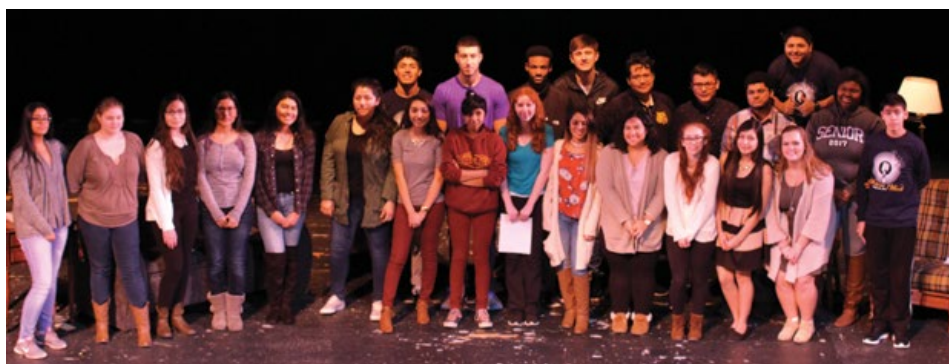
More than 30 students from each campus presented original works during Writers Week, a three-day celebration of the writing craft.