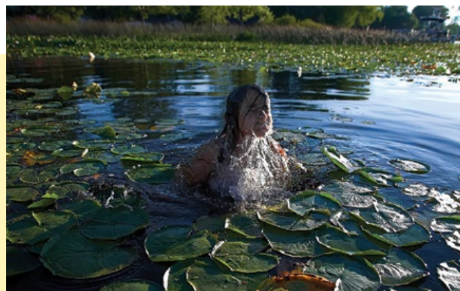
Bart Saminski Water Lilies Photography