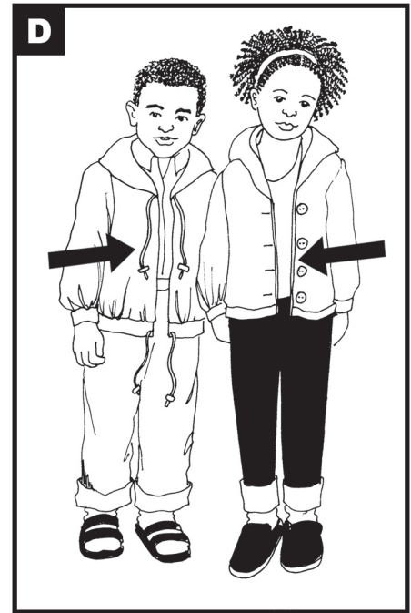
These drawstrings are too long. They have large toggles that are more likely to catch.