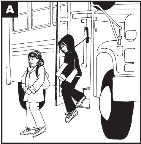
As a child gets off the bus, a drawstring or backpack strap can catch in the handrail.