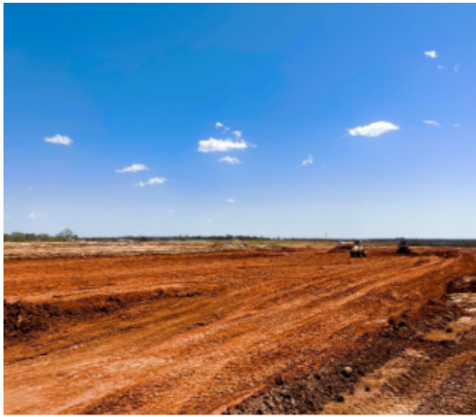
Building Pad Lifts Fine Arts Wing (Areas F-N)